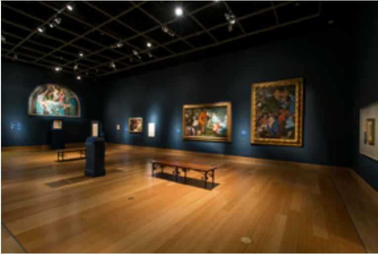
Image 6. Installation Photograph, Gallery 5 The Ringling Museum's Veronese Show

This gallery offers a selection of Veronese's tastes in religious and biblical subjects. Of special interest is the master's large canvas Rest on the Flight into Egypt (back wall, far right); see Image 9, below. This photograph shows the installation's use of space, lighting, variety of exhibit formats, and a courteous concern for visitors' comfort and viewing.