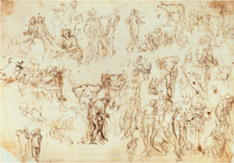
Image 11. Veronese, Sheet of Studies for The Consecration of David, and for Figures and Architecture at Villa Barbaro, Maser (c1558-62)

Pen and brown ink and wash on paper, 21.4 x 31.1 cm