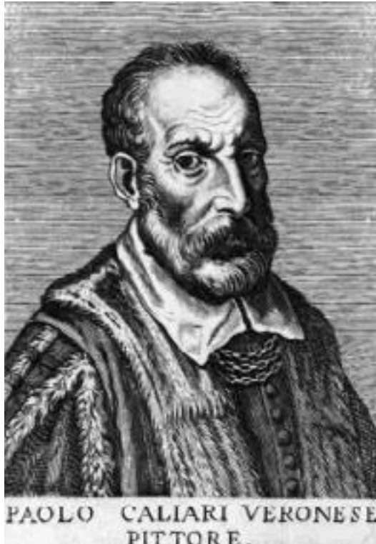
Image 1. Paolo Caliari Veronese (1528-1588) by Carlo Ridolfi

VERONESE SHOW (2012-2013) THE JOHN AND MABLE RINGLING MUSEUM SARASOTA, FLORIDA