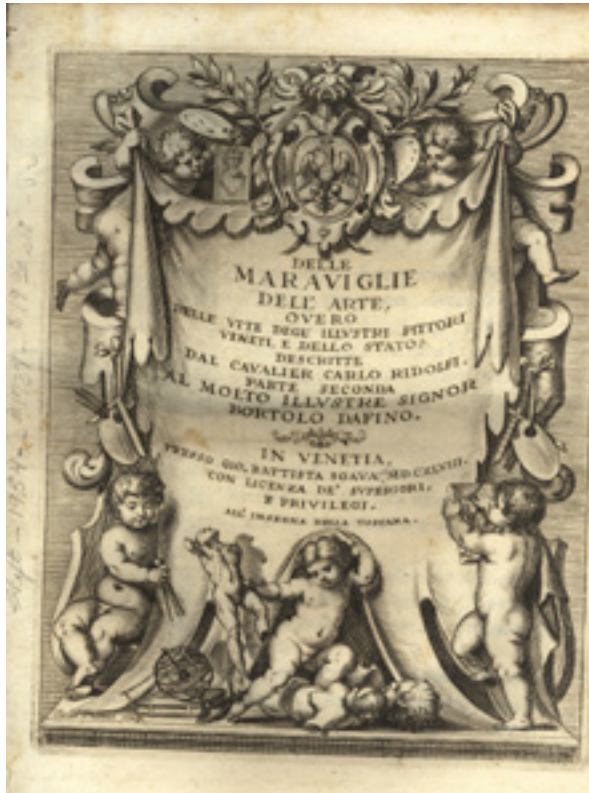
Image 8. Title-page, Carlo Ridolfi, Delle maraviglie dell'arte . 2 vols. Venice, 1648

The Currency of Veronese in the Seventeenth-Century Book Market