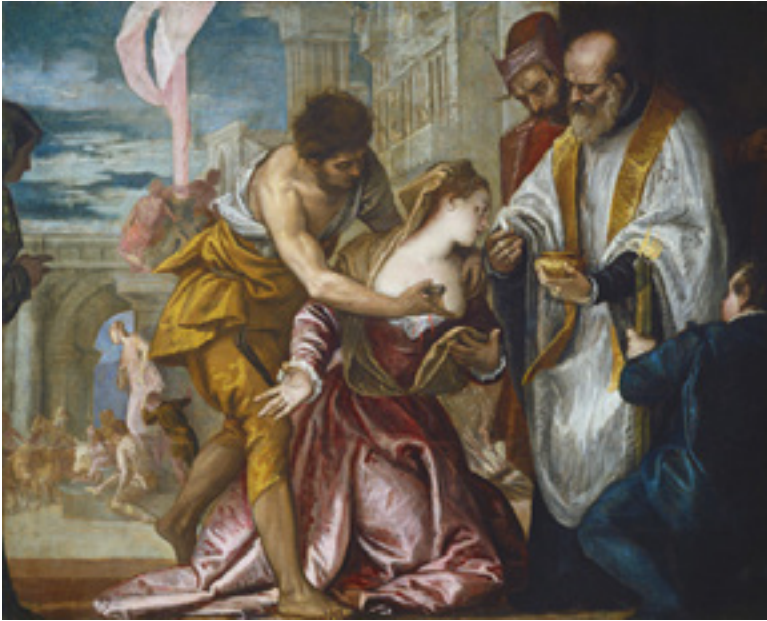
Image 13. Veronese, Martyrdom and Last Communion of Saint Lucy (c1585)