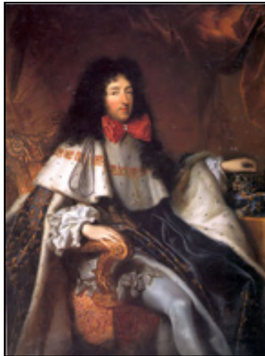
Image 20. Duke of Orléans by Mignard