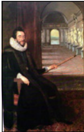
Image 18. Lord Arundel by Mytens