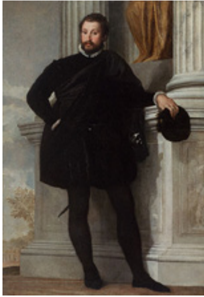
Image 12. Veronese, Portrait of a Man (c1576-1578) Oil on Canvas. 75 5/8 in. x 52 3/4 in. Gift of J. Paul Getty Lender, Getty Museum, Malibu, California