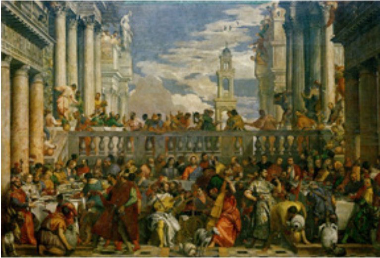
Image 16. Veronese, The Wedding Feast at Cana in Galilee (1562-1563). Detail

Oil on canvas. Height, 6.77m.; Width, 9.94m