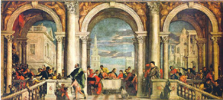
Image 15. Veronese. The Last Supper. Renamed, Feast in the House of Levi (1573)

Oil on Canvas. 555 x 1280 cm (18 x 42 feet). Galleria dell'Accademia, Venice.