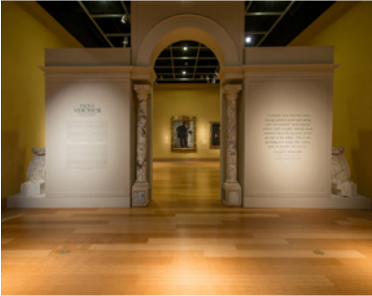
Image 5. Installation Photograph, Entering Gallery 1 The Venetian Staging of The Ringling Museum's Veronese Show

The curators and their installation team masterfully installed the show with the 'look' and ambience of sixteenth-century Venetian opulence. Complementing the exhibits was the show's period architecture (columns, archways, statuary, exhibit pedestals), as well as samples of period fabrics, prepared scrim, and beautifully scripted wall graphics. Like seventeenth-century collectors and connoisseurs of Veronese, visitors to Sarasota's recent show were captured by the magic of Renaissance Venice.