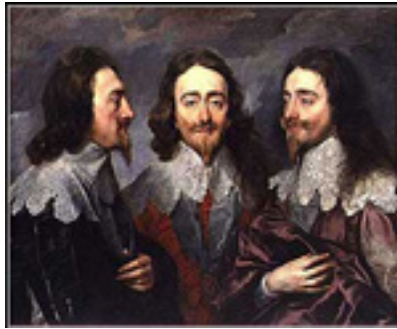
Image 17. Charles I by Van Dyck

(most of the early grand collections were dispersed: changing times, changing tastes)