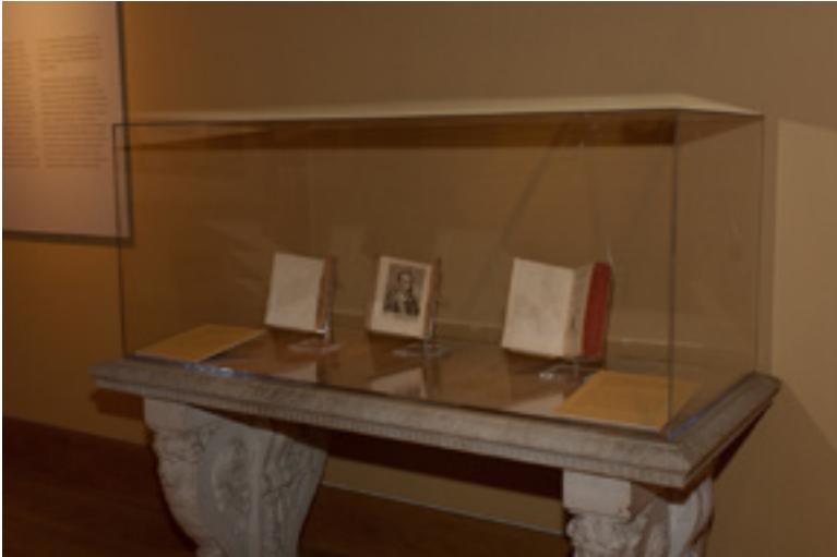
Image 7. Installation Photograph, Case Display

The Currency of Veronese in the Seventeenth-Century Book Market