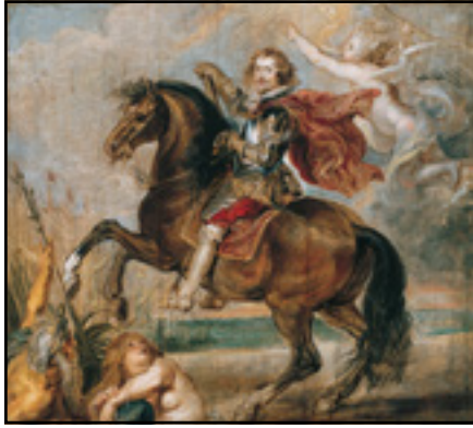
Image 19. Duke of Buckingham by Rubens