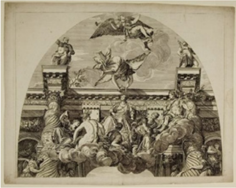
Image 14. Currency of Veronese among Seventeenth-Century Printmakers

Print (etching), The Triumph of Venus , Plate 1 of 2, by Valentin Lefevre (Flemish, 1637-1677)