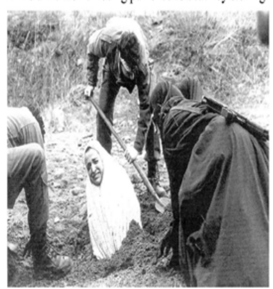
Figure 1, Islam: Oppression of Women.

An Islamic woman being punished to death by stoning.