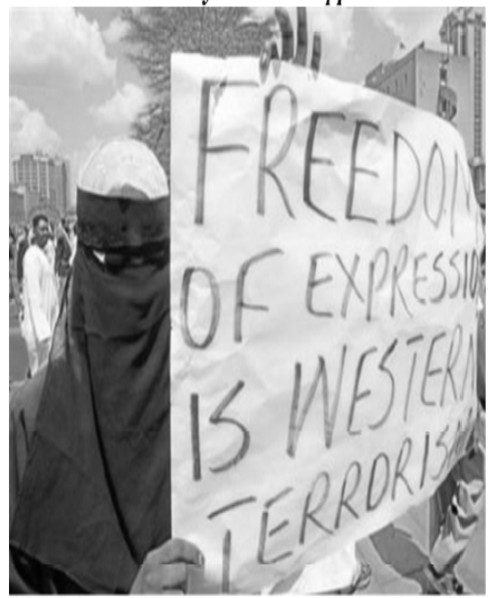
"Freedom of Expression is Western Terrorism"

These are the truths you're not supposed to know!