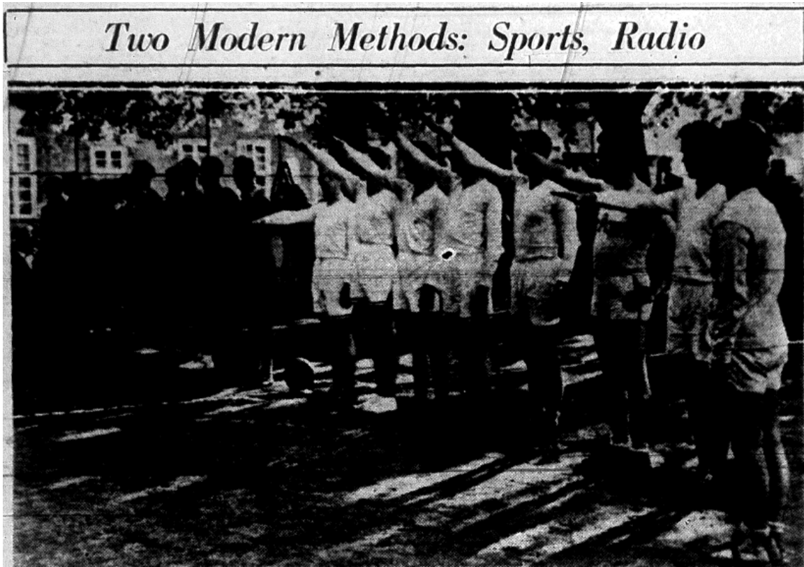
Figure D-1: “In Germany, Herr Hitler has sought the services of the Elders to teach basketball to the teams he hopes will achieve a Nordic victory at the Olympic games to be held this year in Berlin.” This six-column photograph ran in the church-owned broadsheet daily newspaper in Salt Lake City in the midst of an international campaign to boycott the 1936 Olympic Games in Berlin because of the Nazi Government’s discrimination against Germany’s Jewish citizens.