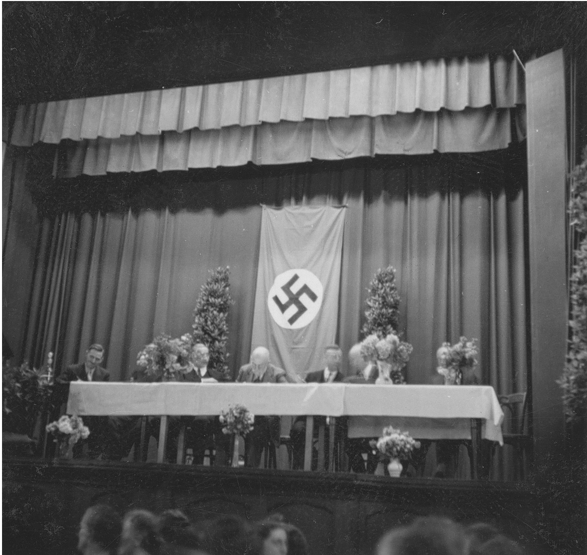
Figure G-1: The Mormon’s Prophet, Seer, and Revelator, Heber J. Grant, presides with his mission presidents at a banquet in Frankfurt. Every assembly hall in Germany at this time came equipped with a large Swastika flag. However, the church-owned newspaper in Salt Lake City had no reservation about publishing a picture of the church president appearing with Nazi symbolism.