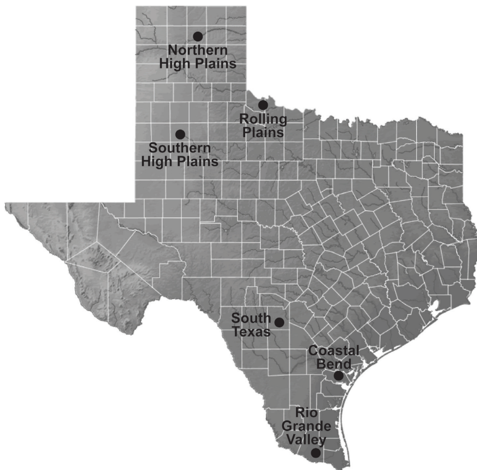
Figure 1. Six regional irrigation conferences were held in Texas between February 2008 and January 2009.