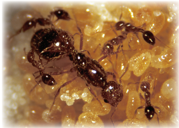
Imported fire ant queen, workers and eggs.

Most people (about 80 percent according to one survey) try to control fire ants by treating the mounds. Mound treatments are expensive—up to $2 or so per mound—and require lots of time and labor if you have much land to treat. With mound treatments, it may be easy to use too much insecticide, which can lead to environmental contamination if rain washes insecticide into lakes and streams. Mound treatments also can be ineffective. For one thing, some nests may go undetected. But even an area where every mound has been treated can soon be reinfested by fire ant colonies migrating from untreated areas or floating there on flood water. Also, deep-dwelling colonies that escaped mound treatment can quickly form mounds after a soaking rain. For most homeowners, it is usually more effective and less expensive to treat the entire yard with a product designed for broadcast application.