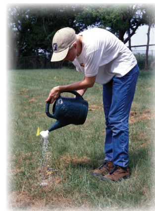
Drench mound treatment.

plant beds and at the bases of tree trunks. Some mound treatment products are available as liquid drenches, injectable aerosols, dusts, or granules that are watered in to the mound. Ants are killed only if the insecticide contacts them, so proper application is essential. These treatments are most effective when ants are nesting close to the mound surface (as they do when the temperature is mild). Colonies should not be disturbed during treatment. If you use a watering can to apply insecticide, do not use the can later for other purposes.