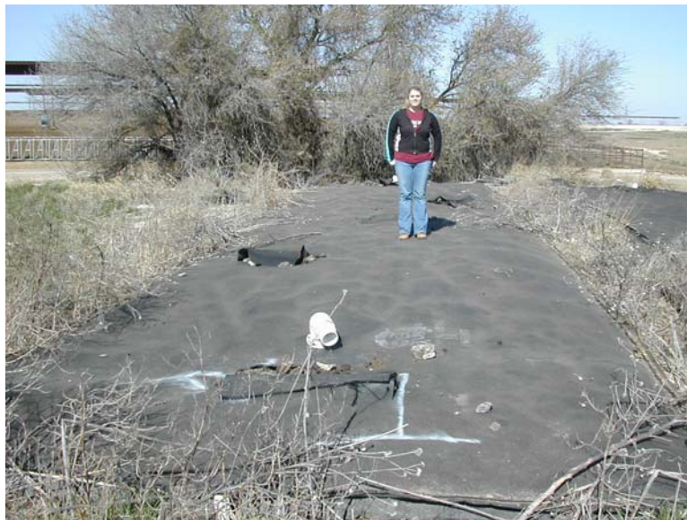
Figure 1. Geotube ® solids were sampled one year after separation from wastewater pumped from the primary lagoon of XXX Dairy in Comanche County, Texas.

An experiment was designed to evaluate six treatment combinations made up of two soil types and three application rates of Geotube ® solids. Each treatment combination was replicated four times. Geotube ® solids were collected from a demonstration site on the XXX Dairy in Comanche County (Fig. 1). The solids were air-dried and sieved through a screen (0.25-inch mesh) before sampling, analysis, and incorporation in soil. The two contrasting soil types were a Windthorst fine sandy loam and Weswood sandy clay loam.