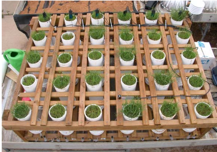
Figure 2. Tifway bermudagrass grown in soil columns with varying soil and Geotube ® material amendments

Soils were packed into polyvinyl chloride (PVC) cylinders (4-in. diameter x 12-in. depth) over a layer of glass fiber cloth, which separated soil from a 2-in. depth of washed gravel. The 4- to 12-in. depth comprised soil without Geotube ® solids. The 0- to 4-in. depth of soil was amended with Geotube ® solids at three rates: 0, 12.5, and 25% by volume. The soil with or without Geotube ® solids was packed within 2-