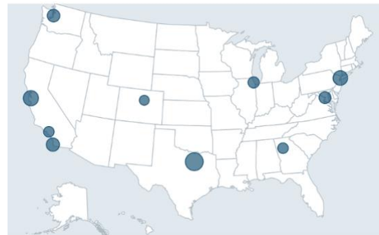
Figure 1: Top 10 locations where 5G-related jobs and professionals with 5G skills are located; bubble size indicates the number of professionals in high to very high hiring demand locations.

Top Locations. The top locations for professionals with 5G skills are Dallas-Fort Worth metropolitan area, San Francisco Bay area, New York City, San Diego, Greater Seattle area, Washington DC-Baltimore area, Greater Chicago area, Atlanta metropolitan area, Los Angeles metropolitan area, and Denver metropolitan area.