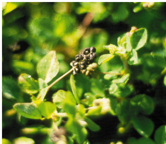
Fig. 1. Black medic inflorescence with mature seed in late spring.

was to compare the relative accumulated yield and quality of entries in March, April, and May.