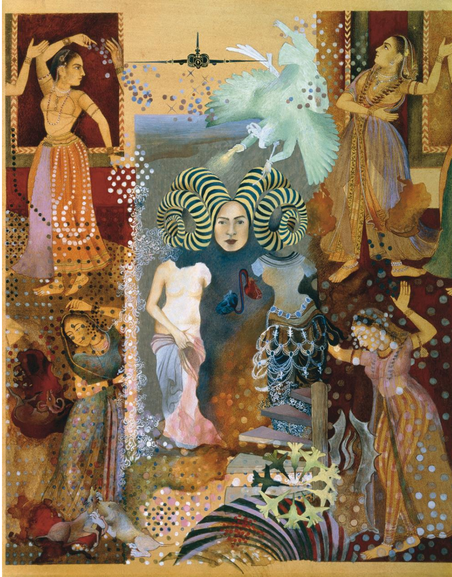
Figure 2: Pleasure Pillars by Shahzia Sikander