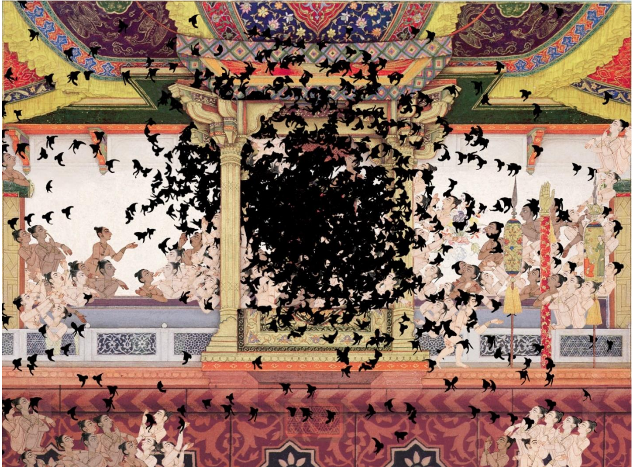
Figure 3: SpiNN by Shahzia Sikander