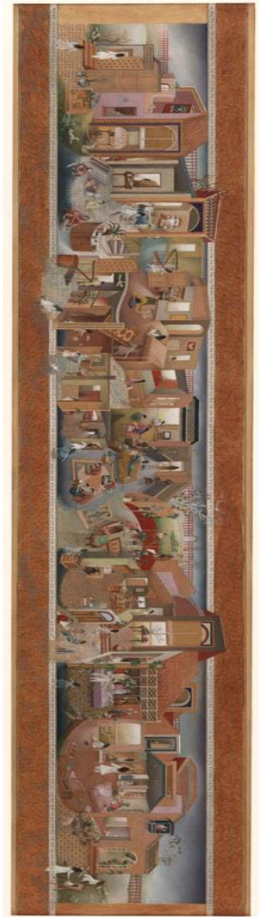
Figure 1: The Scroll by Shahzia Sikander