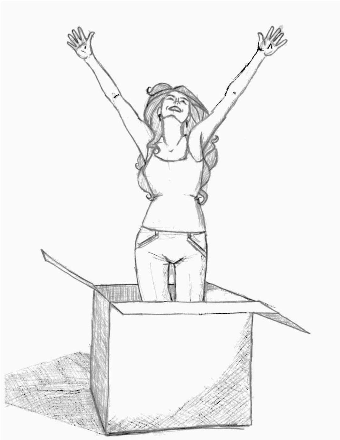
Figure 9. Breaking Free