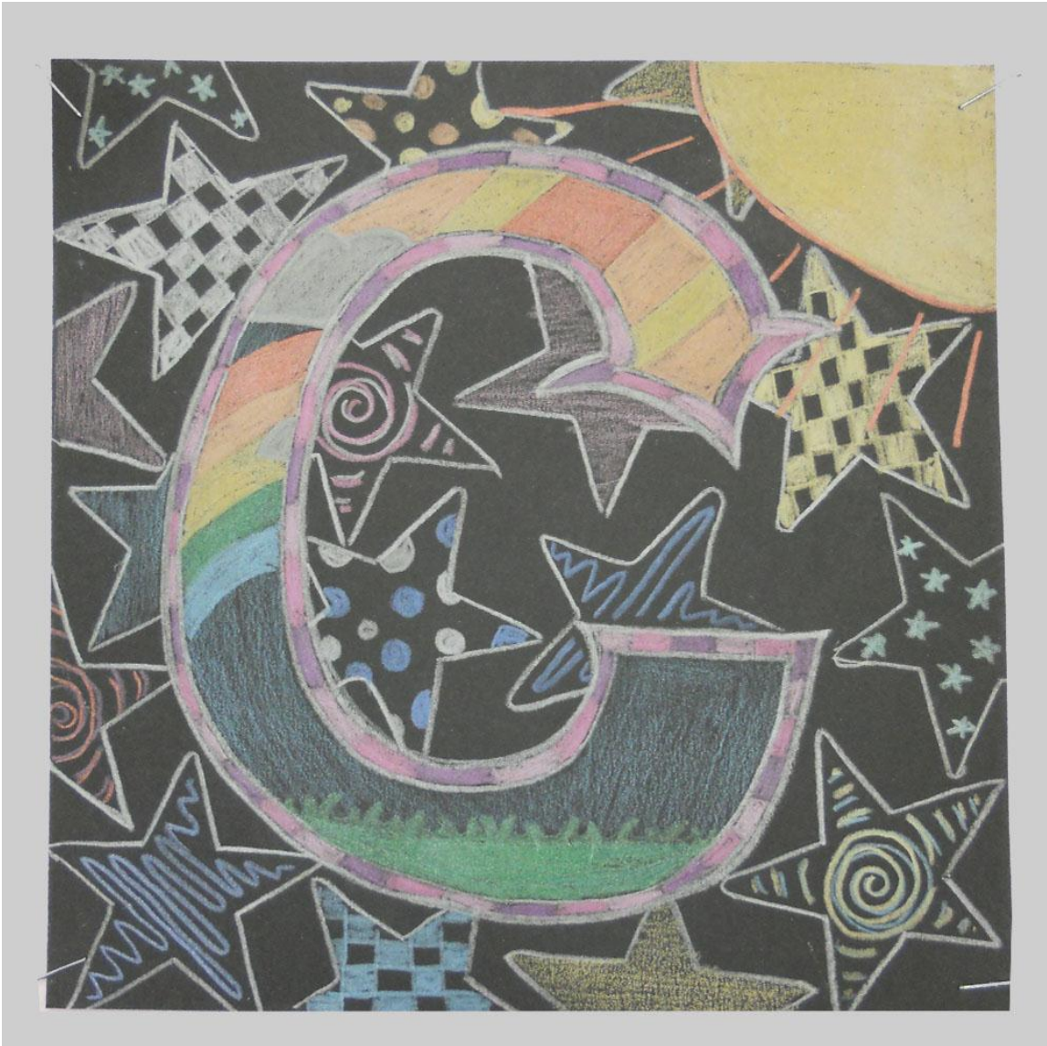
Figure 7. Megan's Illuminated Letter