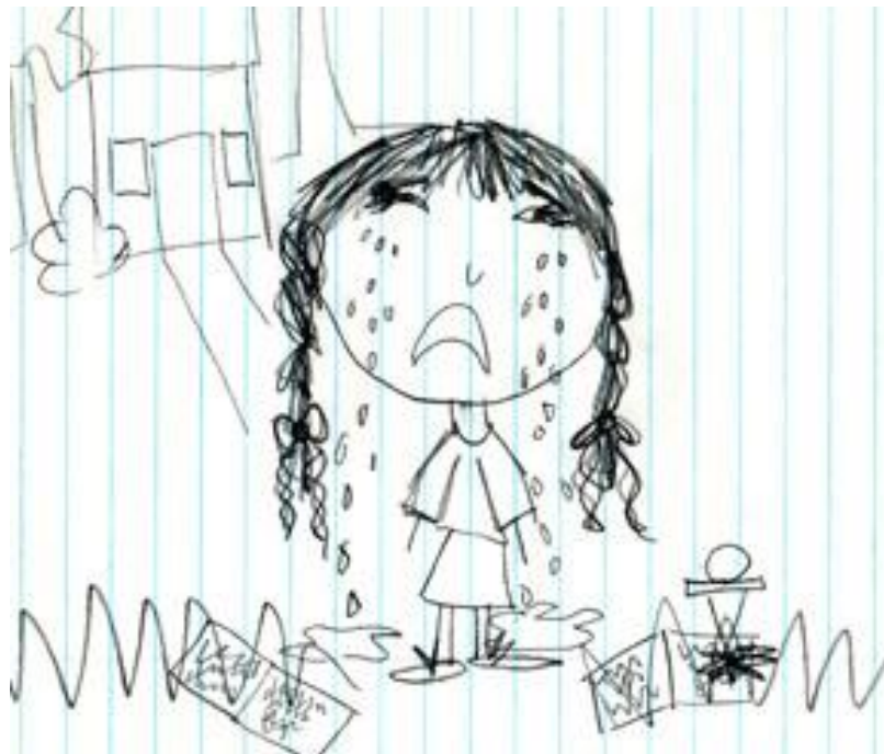
Figure 2. Crying Girl with School Books