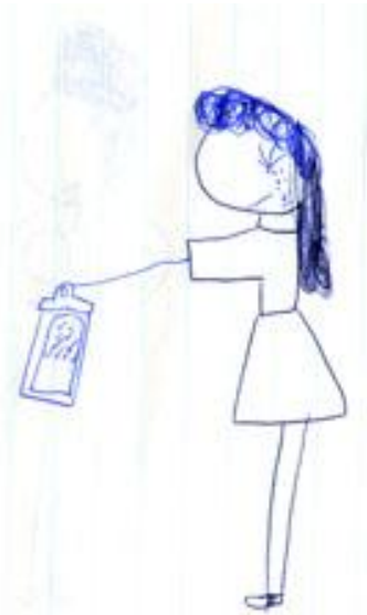
Figure 1. Sad Girl with School Books