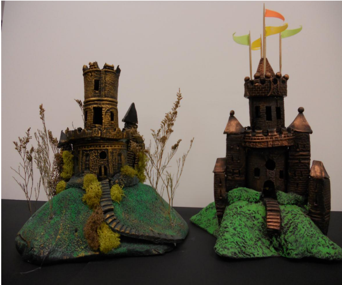
Figure 4. Medieval Castle

castle with trees and shrubs. The literacy activity for this project was limited to the teaching of vocabulary associated with medieval castles and their construction.