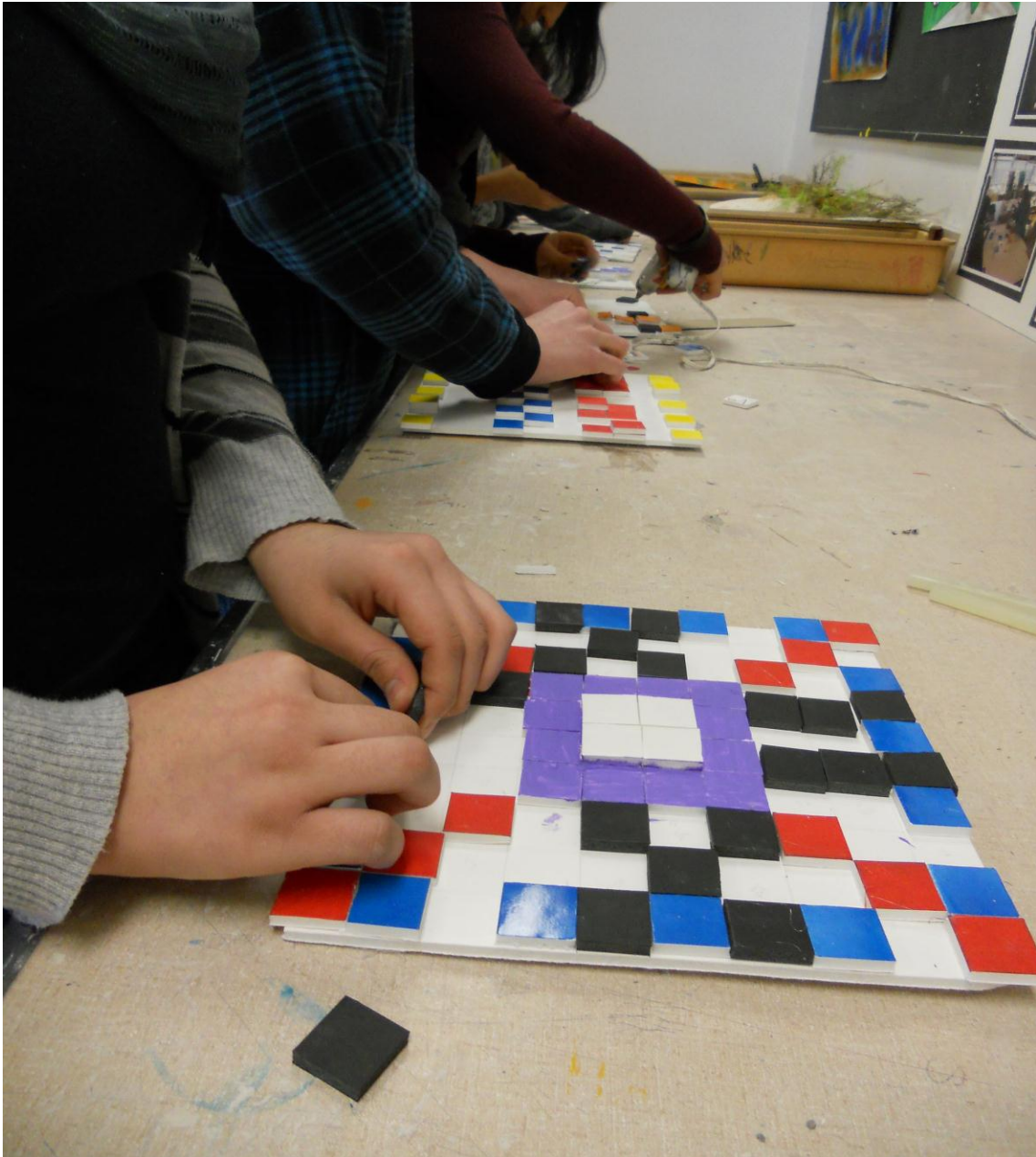
Figure 5. Bas Relief Project

activities related to this project were limited to basic terms associated with abstract shapes and color schemes (Figure 5).