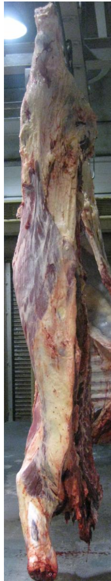
FIGURE 2. Typical pattern opening area where inoculation was applied (e.g., brisket, plate, flank, round, and leg extremities).