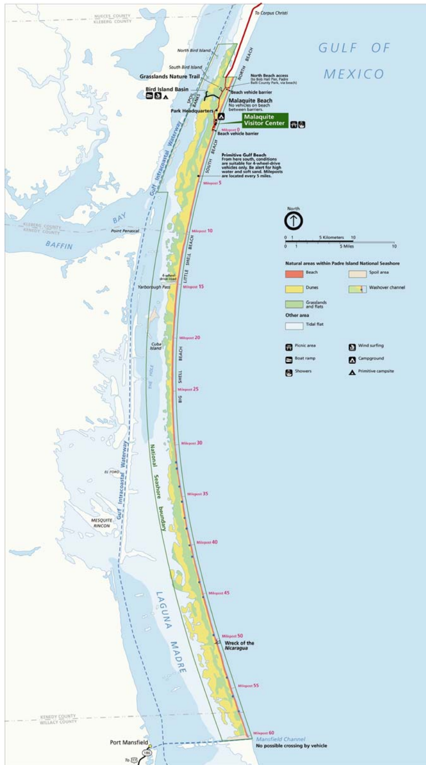
Figure 2. Map of Padre Island National Seashore