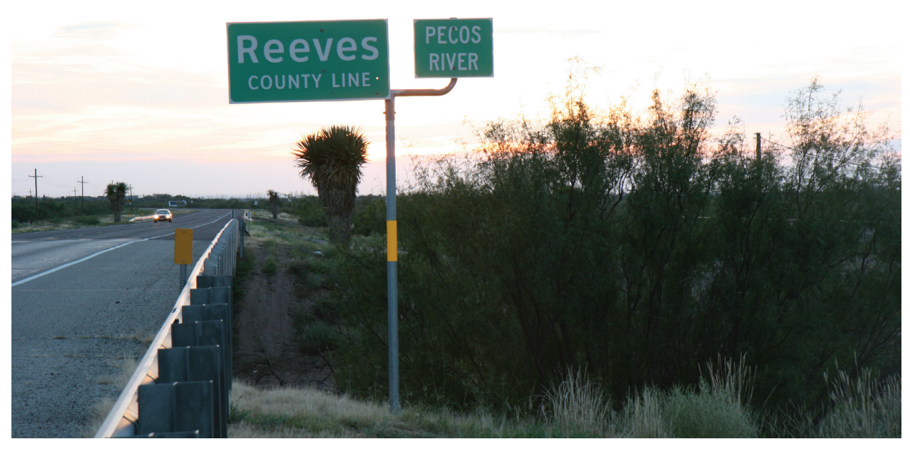
Pecos River at Reeves County Line