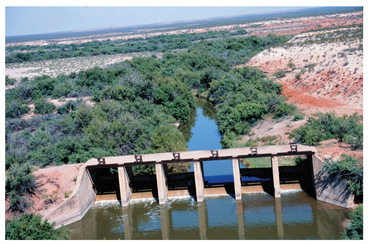
Irrigation diversion dam on the Pecos River near Coyanosa, Texas

flows of surface water and groundwater in the main channel of the Pecos River and its tributaries (Hart et al., 2005). The goal is to quantify the hydrologic impacts that clearing saltcedar might have on the region and to identify the best methods to most effectively control and manage saltcedar; (i.e., the use of biological, mechanical and chemical methods).