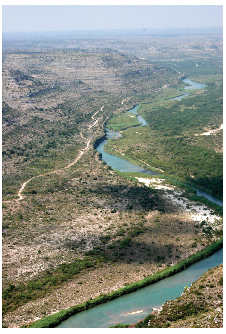
Lower Pecos River near Sheffield

In 1965, a major flood at Sanderson sent a 15-foot high wall of water