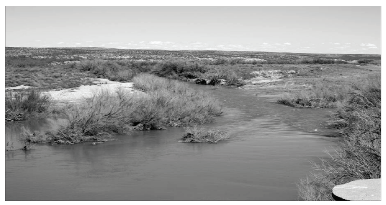
Pecos River, March 2005, after saltcedar control

plowing with heavy equipment. Herbicides were used to control saltcedar in the vicinity of Red Bluff Dam and along a 40-mile stretch from Orla to the city of Pecos.