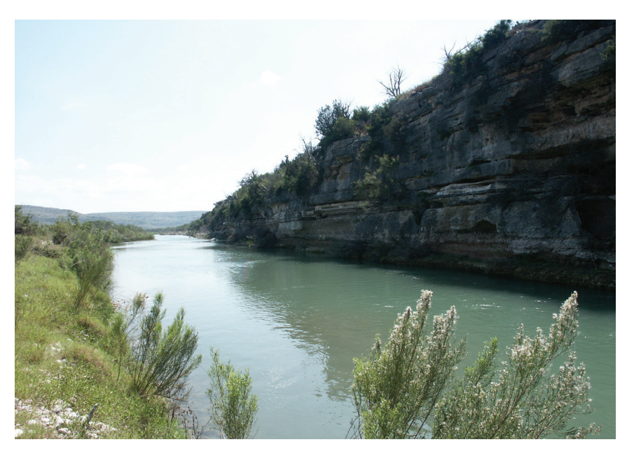
Lower Pecos River near Pandale