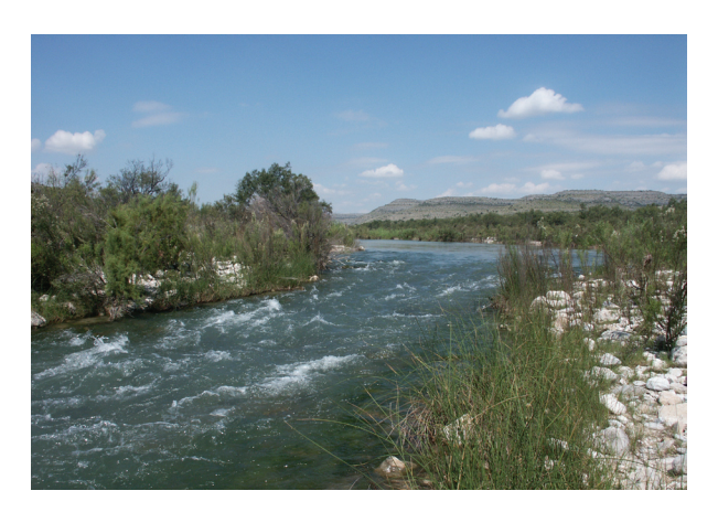
Lower Pecos River near Pandale The Pecos River has been profoundly affected

According to the 2006 Far West Texas Regional Water Plan (LBG-Guyton, 2006), the Pecos River contributes roughly 11% of the flows in the Rio Grande entering Lake Amistad. Salinity from natural sources enters the river at many points, compromising water quality (Miyamoto et al., 2005; Miyamoto, 1996; Miyamoto, 1995). The Pecos River is estimated to contribute roughly 30% of the annual salt loadings to Lake Amistad (LBG-Guyton, 2006).