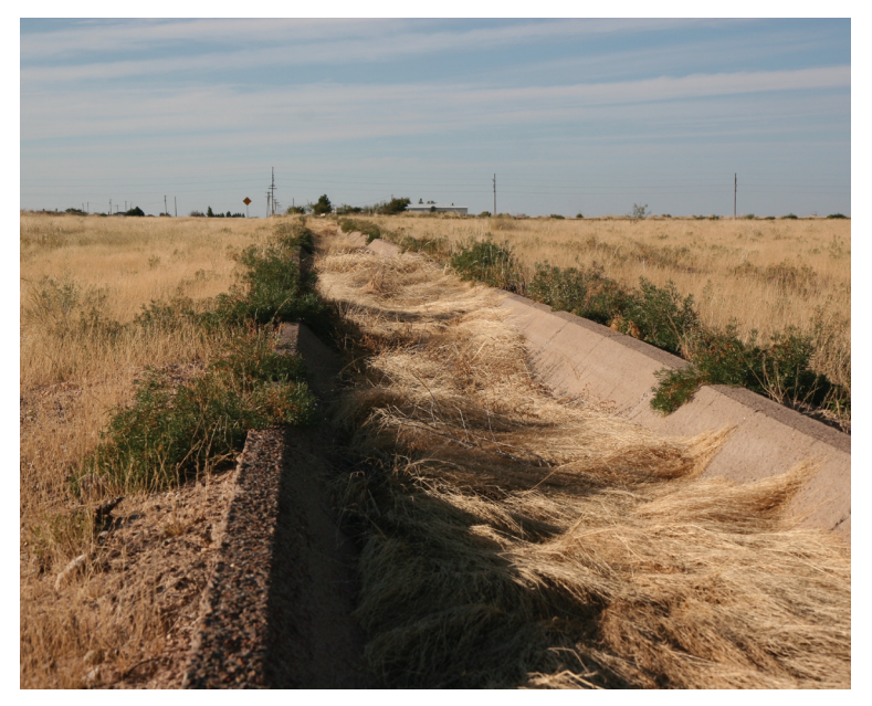
Irrigation Ditch near Pecos, Texas

In 1868, Peter Gallagher purchased lands along Comanche Creek where Comanche Springs is located and supplied irrigation water for alfalfa and other forage crops to support