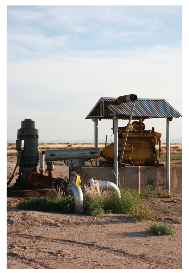
Irrigation well near Pecos, Texas