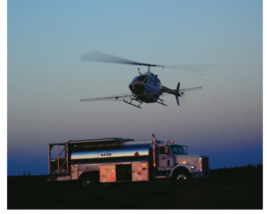
Control of saltcedar included aerial spraying with herbicides

One alternative that can potentially increase the flows of water in the Pecos River Basin is to clear excessive populations of saltcedarandothernuisance brush species that infest much of the zone along the river. TCEQ (Mills, 2005) and other sources (Belzer & Hart, 2006; Hart et al., 2005; El-Hage & Moulton, 1998) suggest that saltcedar and mesquite have replaced much of the native vegetation in the Pecos Basin of Texas, which is thought to have originally consisted of