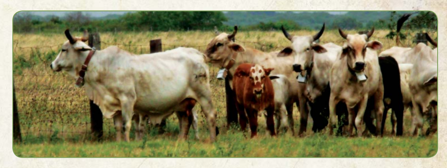
THE LONE STAR HEALTHY STREAMS PROGRAM TEACHES OWNERS OF CATTLE OPERATIONS AND OTHER LIVESTOCK OPERATIONS HOW TO REDUCE BACTERIAL LOADING IN TEXAS WATERWAYS.

Institute (TWRI). "It will provide a one-stop shop for the livestock industry and natural resource agencies to access information regarding bacterial water quality issues related to livestock, as well as measures that can be implemented in response to development of Total Maximum Daily Loads, TMDL implementation plans, and watershed protection plans throughout Texas."