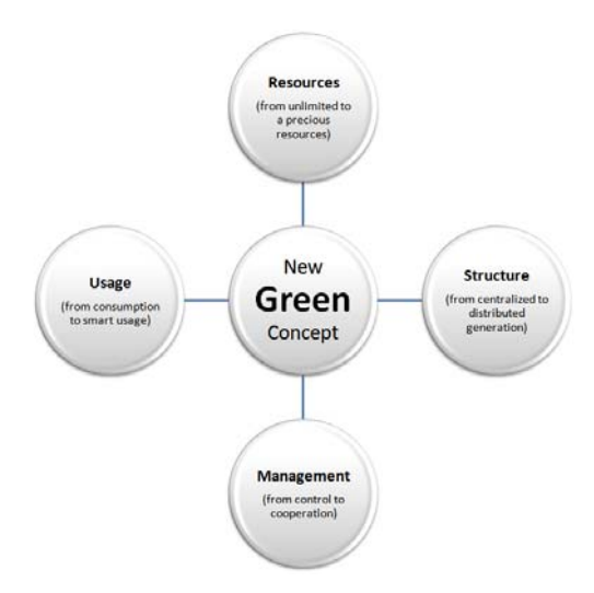
Figure 2: New Green Concept

The interest in new Green solutions is mainly driven by a number of paradigm shifts within the environmental sector, which will be briefly discussed. Recently, our planet's environment faces many challenges that lead the regulators and Non-Governmental Organizations NGOs to induce behavioral changes in the environment management techniques. Those new changes are focused mainly on the environment resources, structure, management, and usage and these are characterized in Figure 2 below.