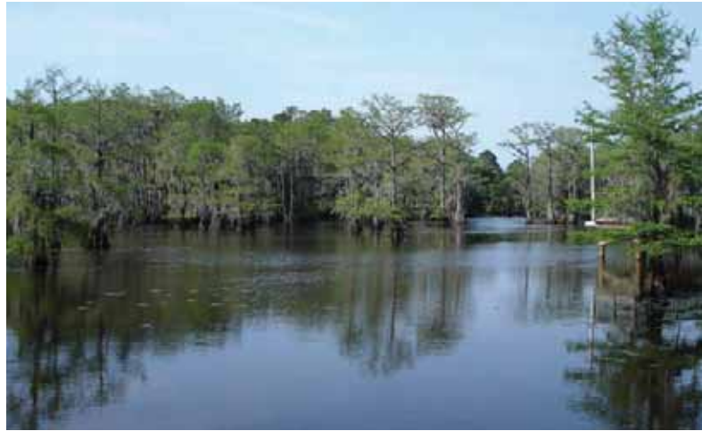
Caddo Lake's signature bald cypress trees need the high and low flow of waters for distribution and germination of their seeds.

These flow recommendations, when implemented by the Corps, will enhance the ecological structure and function of Big Cypress Creek, its floodplain and