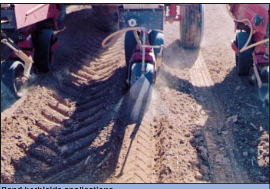
Band herbicide applications.

Banding herbicides over the crop row places the product in the area where it is most needed, yet reduces the total amount applied by 50 to 66 percent in most cases. Untreated areas between rows can be shallowly tilled to control most annual weeds. This practice can dramatically reduce the amount of herbicide that could be carried off