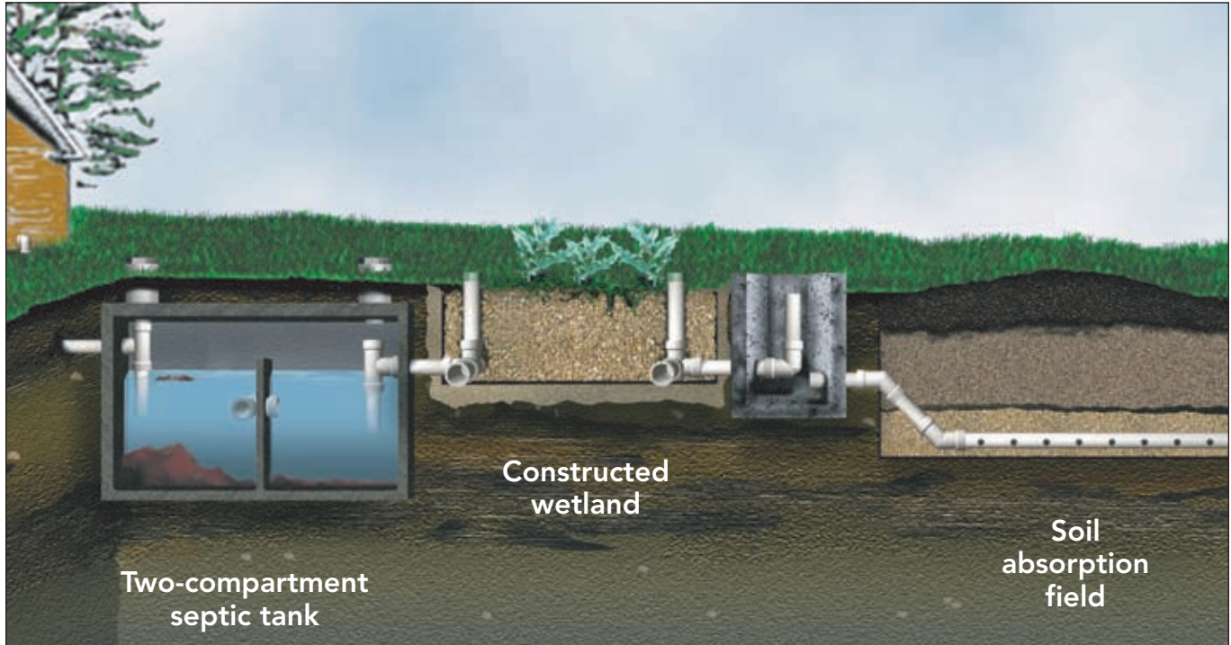
Figure 1: A constructed wetland system.