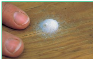
Figure 4. Brown recluse spider egg case.

Brown recluse spiders lay one to two egg masses per year in dark, sheltered areas. Like those of many other spiders, brown recluse egg cases are round, about \frac{5}{8} inch (1.6 cm) in diameter, flat on the bottom and convex on top. After 24 to 36 days, an average of 50 spiderlings emerge from each egg case. Their slow development is influenced greatly by nutrition and environmental conditions.