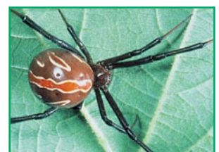
Figure 6. Southern black widow, Latrodectus mactans , immature.