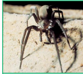
Figure 12. Southern house spider, Kukulcania hibernalis , female.

tinctive web radiates outward from a central lair built in a hole or cavity. Southern house spiders are common in old barns and undisturbed buildings.