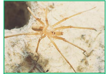
Figure 13. Southern house spider, Kukulcania hibernalis , male.