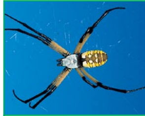
Figure 10. Yellow garden spider, Argiope aurantia .