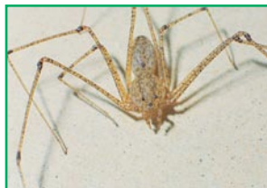
Figure 3. Spitting spider, Scytodes .

One other group of spiders, spitting spiders in the genus Scytodes , has a similar eye arrangement. Spitting spiders have long, spindly, banded legs and a spotted pattern on top of the cephalothorax. The cephalothorax is raised like a dome in spitting spiders but nearly flat in recluse spiders. Spitting spiders are slow-moving and common in window sills and other locations around the house. They are considered harmless.