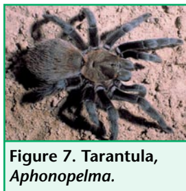
Figure 7. Tarantula, Aphonopelma .

Tarantulas are sometimes kept as pets and can become quite tame. They can be handled, but be careful because they can quickly become disturbed and may pierce the skin with their fangs. In