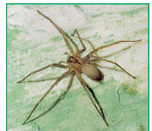
Figure 1. Brown recluse spider, Loxosceles reclusa .

As their name implies, recluse spiders are generally shy. They spin nondescript white or grayish webs, where they may hide during the day. They are predators of insects and other arthropods, known to wander around houses looking for prey.