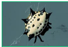
Figure 11. Spinybacked orbweaver, Gasteracantha cancriformis .