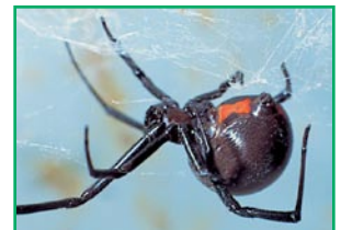
Figure 5. Southern black widow, Latrodectus mactans .

Females lay eggs in a loosely woven cup of silk. The \frac{1}{2} -inch-long, oval egg sacs hold 25 to 900 or more eggs, which incubate for about 20 days, depending on temperature and time of year. Spiderlings usually stay near the egg sac for a few