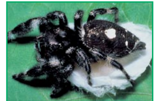
Figure 8. Bold jumper, Phidippus audax .

Wolf spiders hunt at night. They are usually brown and black and may have longitudinal stripes. Wolf spiders are large and often seen under lights. They can be seen at night when their eyes reflect light from a flashlight, headlamp or car headlight.