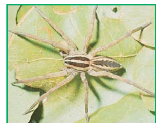
Figure 9. Wolf spider, Rabidosa rabida .