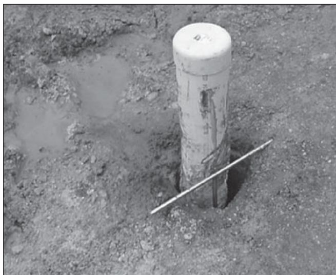
Figure 2. The annular space around this capped well must be properly sealed and a slab constructed around the casing.