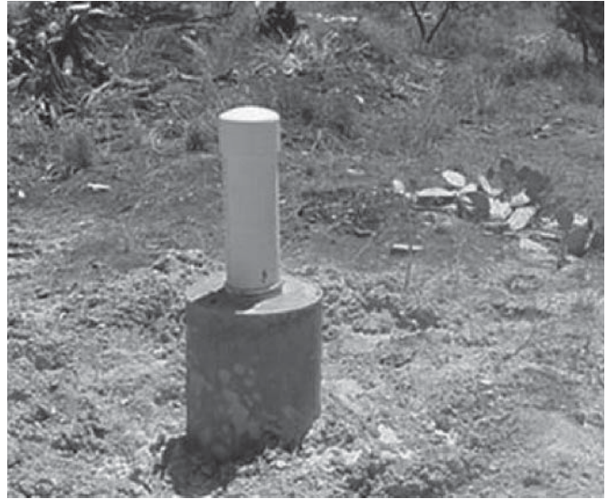
Figure 5. This well has a PVC cap and metal sleeve pipe protection.