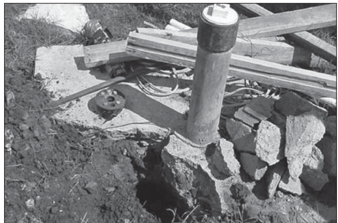
Figure 1. The slab around this capped well must be repaired to keep water from entering the well bore hole.

You can inspect the condition of a well casing at the surface by searching for holes or cracks. Use a light to check the inside of the casing. If you can move the casing around by pushing against it, the casing is probably deteriorating. If you need assis-