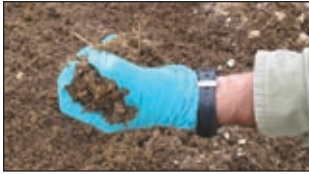
Figure 7. Monitor the moisture content of the pile.

If they do, that sample of material is too wet. If not, drop the material and look at the palm of your hand. If it does not have an obvious sheen of water on it, the sample was too dry.