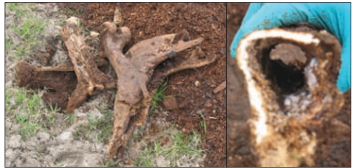
Figure 7. These bones of a 2,000-pound cow that remain from a cured compost pile are brittle, hollow, and fairly easy to crush.

After the pile is turned and moistened, the compost should heat up again and the decomposition process should continue. During this secondary phase the microbes finish off most of the available carbon and nitrogen and convert it into microbial biomass. At this point only the skull, pelvis and other large bones may still be present. Let the Phase II pile sit for about 2 more months until the temperature drops to within 10 degrees or so of the air temperature. Then turn the pile one more time and allow it to “cure” so that the remaining organic compounds (for example, acetic acid) will degrade all the way to carbon dioxide and