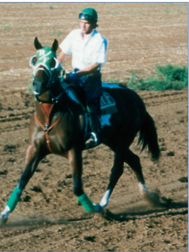
of carbohydrate and fat sources to better perform

Although enough thiamin can be synthesized in the gut to meet the needs of most mature horses, it may not be adequate for racehorses in training. Thiamin is part of an enzyme system involved in energy metabolism in horses. Therefore, racehorses requiring high levels of energy could become thiamin deficient if they take in too little thiamin in the diet. Diets of only oats and grass hay may lack the amount of thiamin needed to meet a horse's requirements.