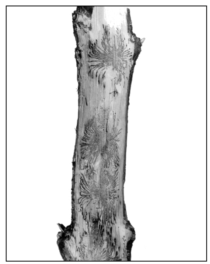
Figure 2. Galleries caused by larvae feeding beneath bark.

To find ways to preserve High Plains elms, Extension personnel from Parmer/Bailey, Hockley/Cochran and Lubbock counties monitored adult abundance in 2000 with financial assistance from the Integrated Pest Management Grant Program, as administered by the Texas Department of Agriculture. They placed traps in these counties and baited them with a synthetic sex pheromone, or chemical attractant, specific for the lesser European elm bark beetle.