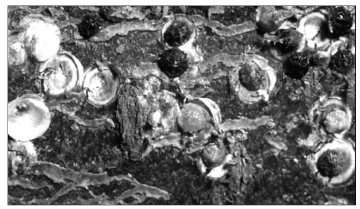
Scale insects can be controlled with horticultural oils.