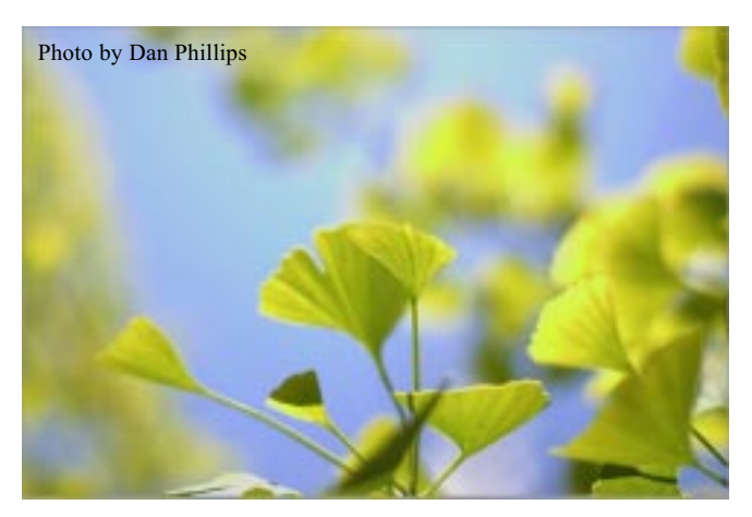
The Ginkgo tree is the only living representative of the order Ginkgoales, a group of gymnosperms with its earliest leaf fossils dating back to 270 million years ago in the Permian period. Though it's range declined rapidly after the dinosaurs became extinct, it was still found in parts of Asia during the Eocene period 50 million years ago.

In this way, researchers have built a precise picture of Earth's past temperature fluctuations and found that 50 million years ago it reached levels that dwarf Earth's current climate crisis. Most experts assumed carbon dioxide, whose levels fluctuate naturally in the air, were responsible. Global warming today is blamed on