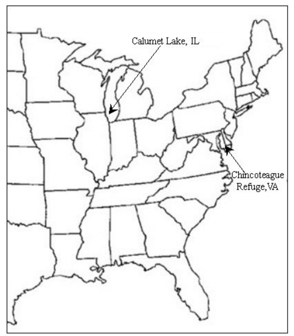
Figure 1. Map illustrating the two study sites for sampling Nycticorax nycticorax populations.

deposited in GenBank. A minimum spanning network showing the relative frequencies of haplotypes in the entire dataset, as well as the evolutionary relationships of haplotypes, was constructed using PAUP* v4.0b10 (see Figure 2) (Swofford, 2002).