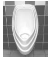
Figure 1. Typical Cartridge-Type Urinal.

Like ordinary urinals, waterless types are plumbed to a standard drain line, but obviously do not use a conventional water-filled trap. Waterless urinals utilize proprietary sealant liquids that act as a vapor trap. The liquids are composed primarily of natural oils that are lighter than water. Urine passes through this liquid and goes down the drain. The