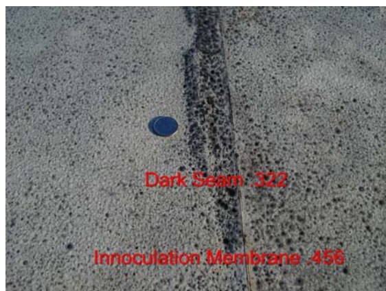
Figure 2. Close-up of Roofing Membrane Affected by Heavy Algae Growth.

commonly based on \text{TiO}_2 or \text{WO}_3 , which exhibit semiconducting properties. Their use in solar-driven hydrogen production from water [5], water detoxification, and removal of volatile organics from gas streams has been well established [6]. This is an environmentally friendly approach that could potentially replace paint and membrane additives whose biocidal effectiveness eventually wears out and whose toxicity may represent a problem.