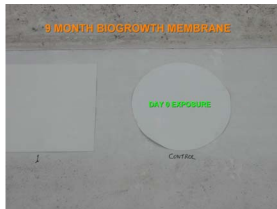
Figure 3. Experimental Installation in Homestead, FL. left: sample with photocatalytic coating; right: control; above: 9 months-aged inoculation membrane.

Reflectance measurements were taken at approximate 6-month intervals with a Devices & Services Company Solar Spectrum Reflectometer Model SSR-ER Version 5.0. Readings were reported relative to zero and 100% of a calibrated Glazed Ceramic #A92 working standard. A discussion of solar reflectance measurement methods can be found in reference 7. The TPO test ran for 24 months. A subsequent set of PVC (polyvinyl chloride) samples was installed and observed for 18 months.