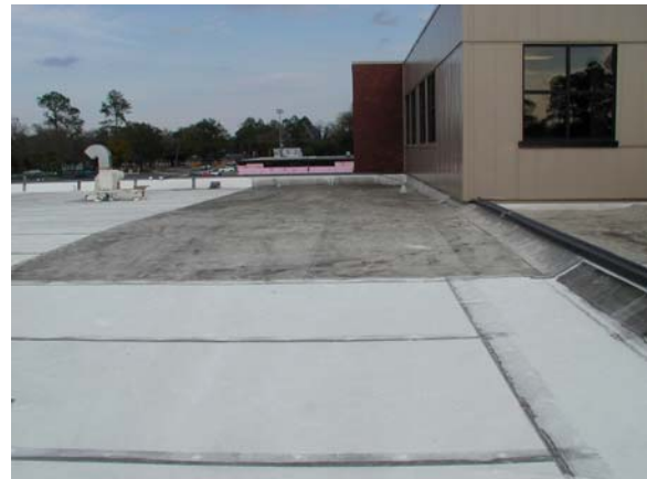
Figure 1. New and Aged Samples of Installed Roofing Membrane.

or membrane surface with age and successive rainfalls. The biocide is absorbed by the microorganism attempting to attach to the surface, resulting in cell death. This process is effective as long as there is biocide available to be leached out of the paint or membrane surface. Once that reserve is depleted, the surface is no longer protected from the action of nuisance microorganisms.