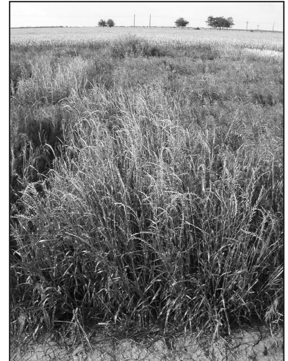
Figure 1. Mature ryegrass in Texas.

Rotating to a summer crop allows you to use non-selective herbicides and tillage in the winter. Timely control of ryegrass infestations in winter-fallow fields can greatly reduce ryegrass seed in the soil. Rotating to summer crops also allows you to use additional herbicide modes of action to control any ryegrass that survives winter control measures.