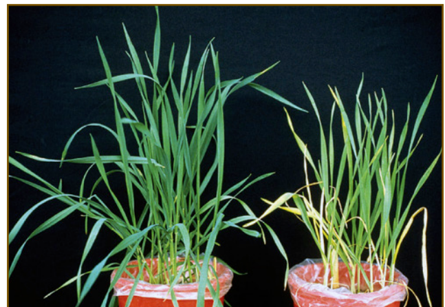
Figure 1. Healthy wheat (left) and nitrogen deficiency symptom in wheat (right)

in the older leaves first. With N deficiency, yellowing starts from the tip of the lower (older) leaves progressing to the base of the leaf without interveinal chlorosis (Fig. 1). Nitrogen deficiency often occurs in water-logged conditions. Although it is rarely found in Texas, molybdenum (Mo) and manganese (Mn) deficiency symptoms also show chlorosis in older leaves. Nitrogen deficiency is a common nutrient deficiency symptom in the Rolling Plains, High Plains, and in west Texas, especially in wheat planted after cotton.