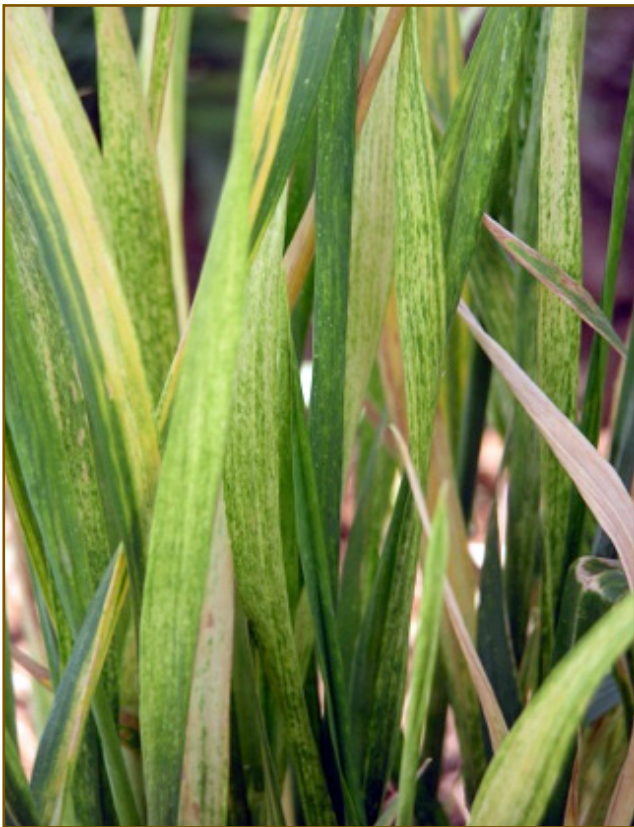
Figure 8. Wheat Streak Mosaic Virus

tissue (saprophytic fungi) and are often mistaken for diseases that might require control. If you suspect any of these diseases may be affecting your wheat, Texas A&M AgriLife pathologists can help you diagnose and identify them ( http://amarillo.tamu.edu/amarillo-center-programs/extension-plant-pathology/ ).