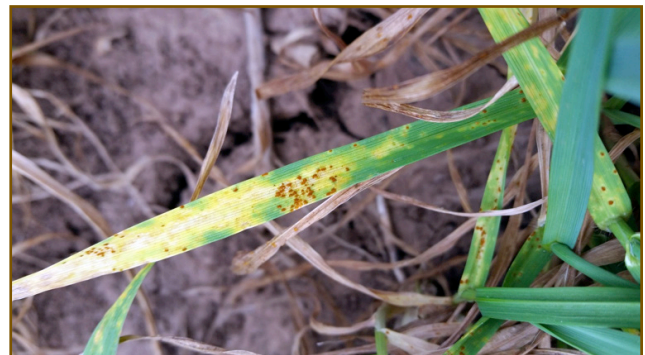
Figure 7. Rust infestation in wheat

There are three viral pathogens that commonly infect wheat in Texas' Rolling and High Plains: Wheat Streak Mosaic Virus (WSMV), Triticum Mosaic Virus (TriMV), and High Plains Virus (HPV), which is more properly referred to as Wheat Mosaic Virus (WMoV). Light green to yellow streaking and mottling appear on the leaf in the spring (Fig. 7). Often, early symptoms are confused for N deficiency and/or water stress. Many producers attempt to rectify the symptoms with fertilizer and irrigation, but the infection prevents the plant from using these. A less common viral disease is Wheat Soilborne Mosaic Virus, which regularly occurs in Oklahoma and may occur in the Rolling Plains. Symptoms are similar to other mosaic viruses and generally appear in early spring as wheat breaks dormancy. It also can show up in wetter, low-yielding areas of a field. In central and South Texas, rust often overwinters and during mild winter, rust pressure can lead to yellow spotting or yellowing leaves.