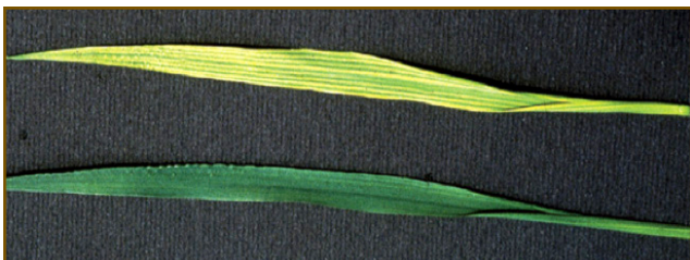
Figure 3. Iron deficiency symptom in wheat

Iron (Fe) is also an immobile nutrient; however, it can be distinguished from S deficiency symptom by the unique pattern of chlorosis. This shows up as green and yellow striping between the veins (interveinal chlorosis) (Fig. 3). Iron deficiency is most common on highly alkaline soils (pH 7.5-8.2), recently limed soil, or soil high in P, Cu, Mn, and Zn.