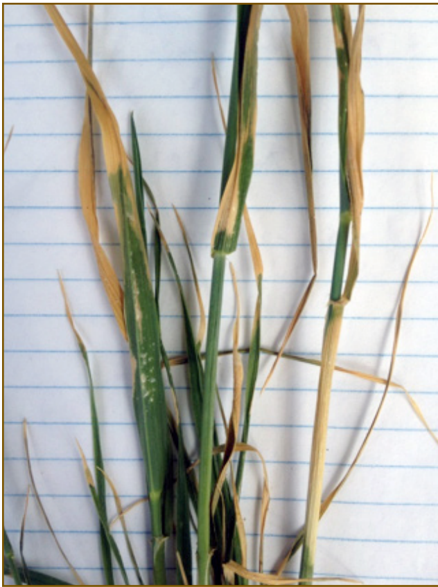
Figure 5. Fertilizer burn in wheat