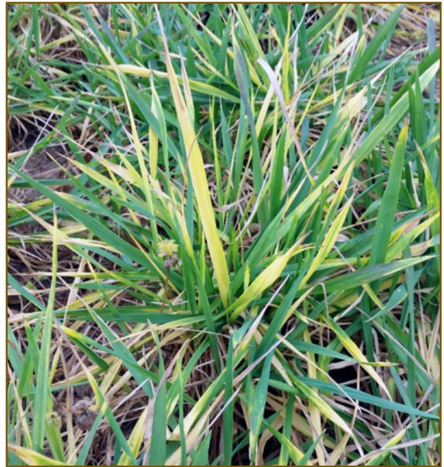
Figure 4. Glyphosate injury

Interveinal chlorosis may also be caused by damage from group B herbicides, which include the sulfonylureas (SUs), sulfonamides, imidazolinones (IMIs), and triazo-lopymidine. Refer to your spray records to check the rate and timing of herbicide applications made in the field. Also, observe if the yellowing in the field occurs in streaks that could be attributed to spray patterns. Herbicide damaged wheat may recover depending upon the severity. Tank contamination by other herbicides such as Roundup (glyphosate) can cause chlorosis of the entire plant, often accompanied by necrotic tips and leaf death (Fig. 4).