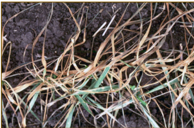
Figure 6. Freeze injury in wheat

A sudden drop in temperature can cause leaf burn. This yellowing may be more concentrated in the low areas of a field where cold settles when there is no air movement (Fig. 6). Freeze injury during the tillering stage has little effect on final grain yield. Wheat can recover from freeze injury by developing new leaves from the growing point assuming it was not damaged during tillering or jointing. However,