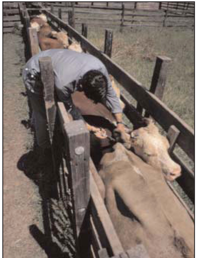
Crowd cattle in a lane chute to properly administer injections in the neck.

Noninfectious vaccines include killed vaccines, bacterins, toxoids, leukotoxoids and chemically altered, body temperature sensitive, modified live vaccines that are injected intramuscularly. To be effective, two doses of a noninfectious vaccine administered at a 2- to 4-week interval are necessary. The first vaccination is a priming,