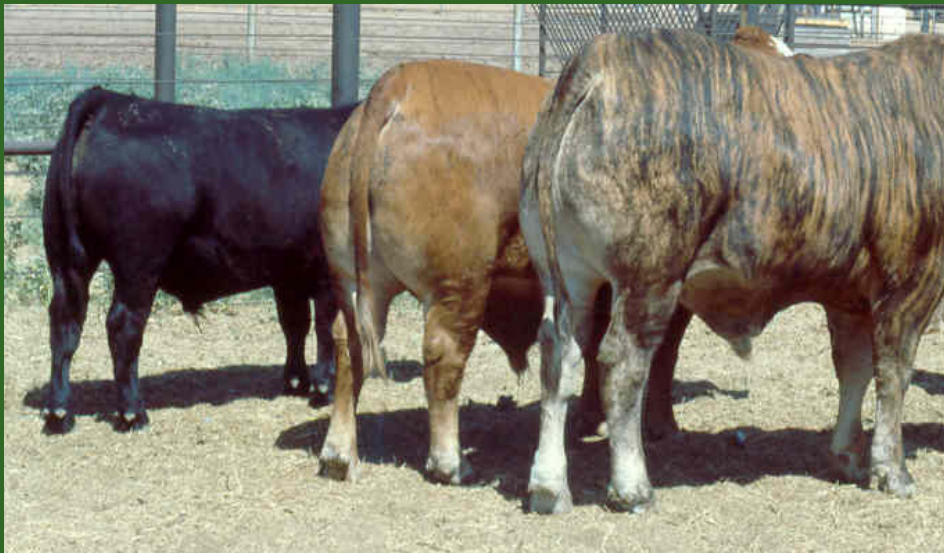
Stephen P. Hammack and Ronald J. Gill*

B ody size is an important genetic factor in beef cattle production. Historically, size was first estimated by measurements such as height or length. As scales were developed, weight became more common as a measure of size. Although measurement and weight are related, their rates of maturity differ. By 7 months of age, cattle reach about 80 percent of mature height but only 35 to 45 percent of mature weight. At 12 months, about 90 percent of mature height is reached, compared with only 50 to 60 percent of mature weight.