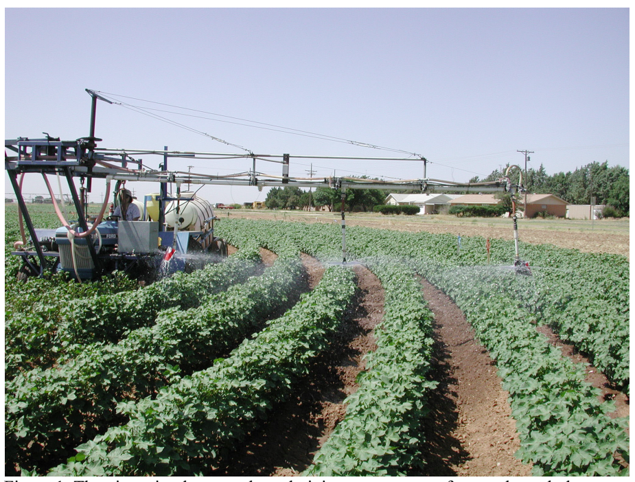
Figure 1. The pivot simulator used to administer treatments of water through three irrigation applicators.