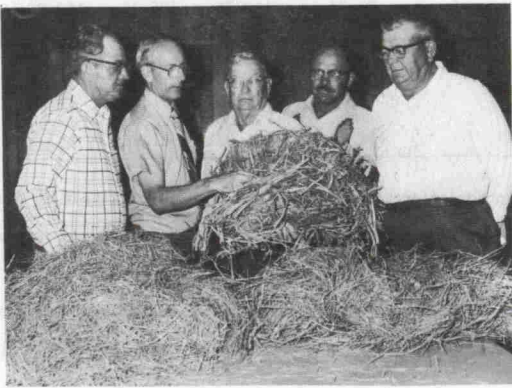
Figure 15-3. At a County Hay Show, forage and livestock producers learn ways to produce better quality hay.

Hay shows are a popular and effective method of encouraging quality hay production. Hay shows have been conducted in more than 100 counties in Texas, with approximately 60 counties sponsoring a hay show each year. Results of several years' hay shows in one county reveal that protein content of hay samples has increased to 12.7 percent