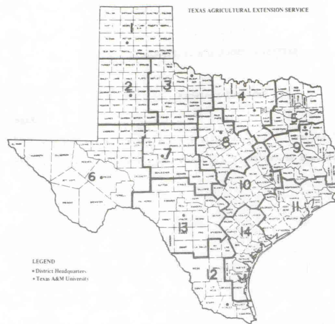
Figure 15-1. Counties with similar soil, climatic, and agricultural production are grouped into 14 Extension Districts.

1. Publications on various aspects of forage production and utilization. Publications provide an effective medium for distribution and a ready reference for forage. Guidelines for pasture production and utilization have been developed and emphasized in "Keys to Profitable Permanent Pasture Production" for five areas of Texas, delineated on the basis of climatic conditions. The production guidelines contain specific and precise descriptions of the latest information for each practice, based on research and local result demonstrations. Timely practices to achieve desirable growth and quality are emphasized. Leaflets on popular grasses show the area of adaptation and list practices for establishment and production of the species. Publications on other aspects of pasture, hay and silage production have been developed (Figure 15-2).