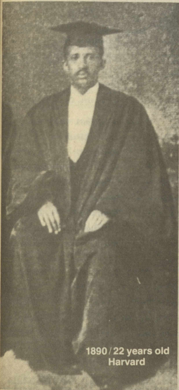
1890 / 22 years old Harvard