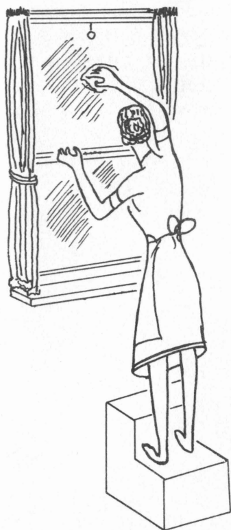
WASH WINDOW PANES

Use crumpled newspaper dampened in water.