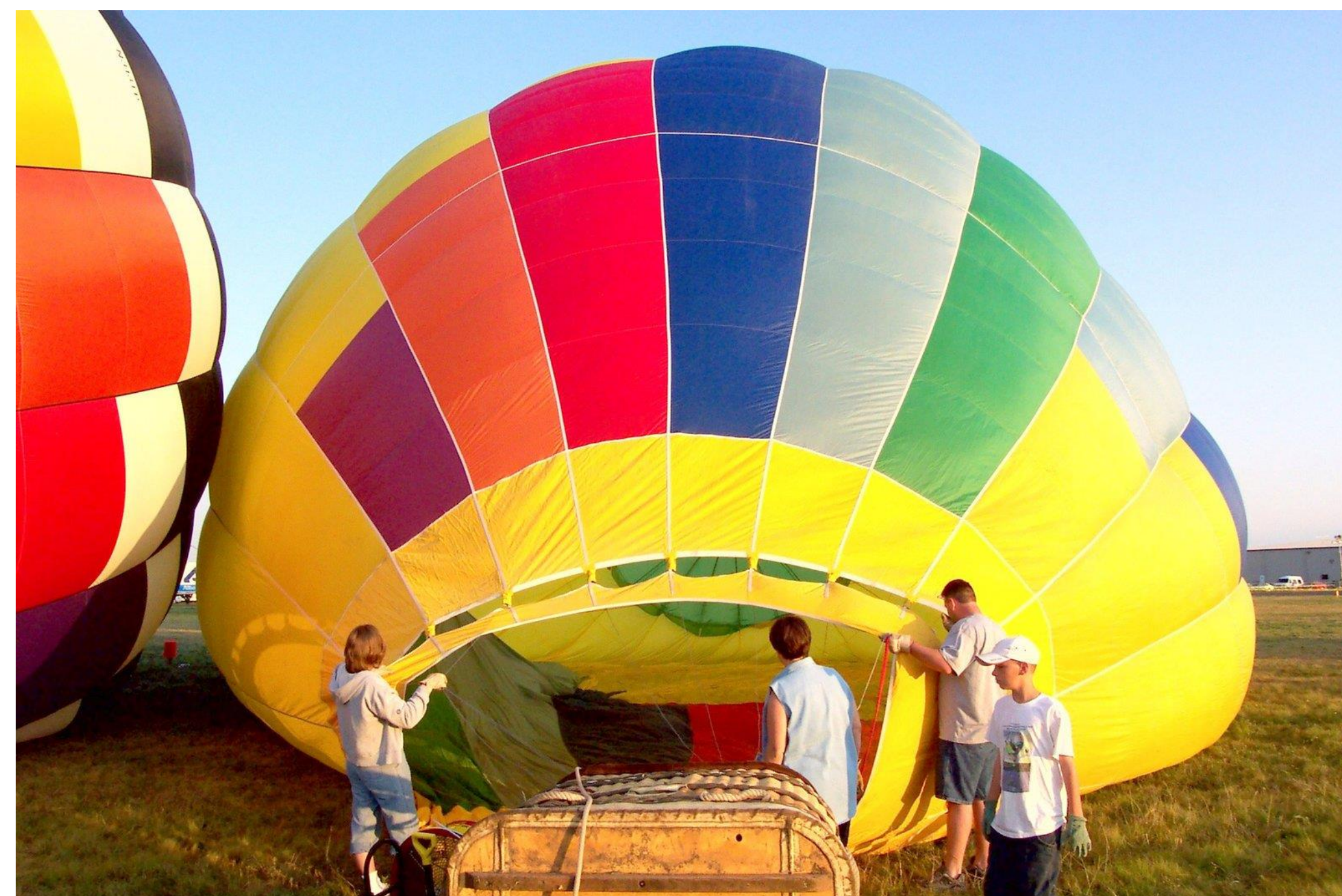
Figure 1. Ready to release, but where to go?

Is this journal considered legitimate in my field? How do I know my work is being published where my potential audience is looking? How can I reach the largest relevant audience? Can I measure the impact of my scholarly work (i.e., citations or downloads)?