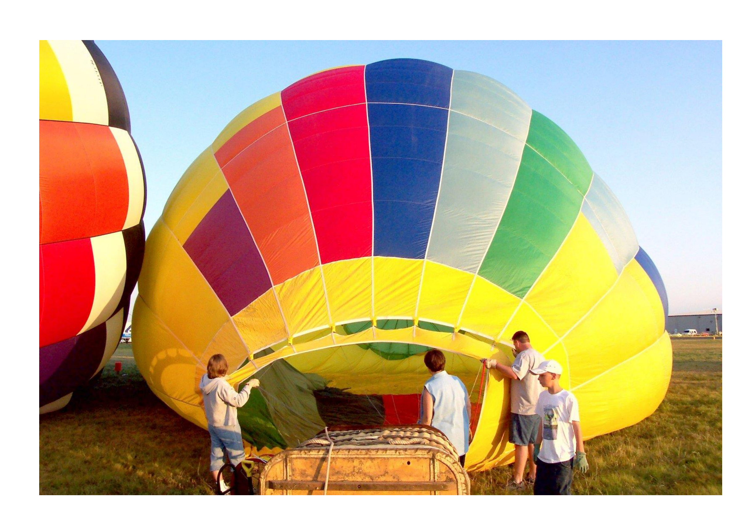
Figure 1. Ready to release, but where to go?

Is this journal considered legitimate in my field? How do I know my work is being published where my potential audience is looking? How can I reach the largest relevant audience? Can I measure the impact of my scholarly work (i.e., citations or downloads)?