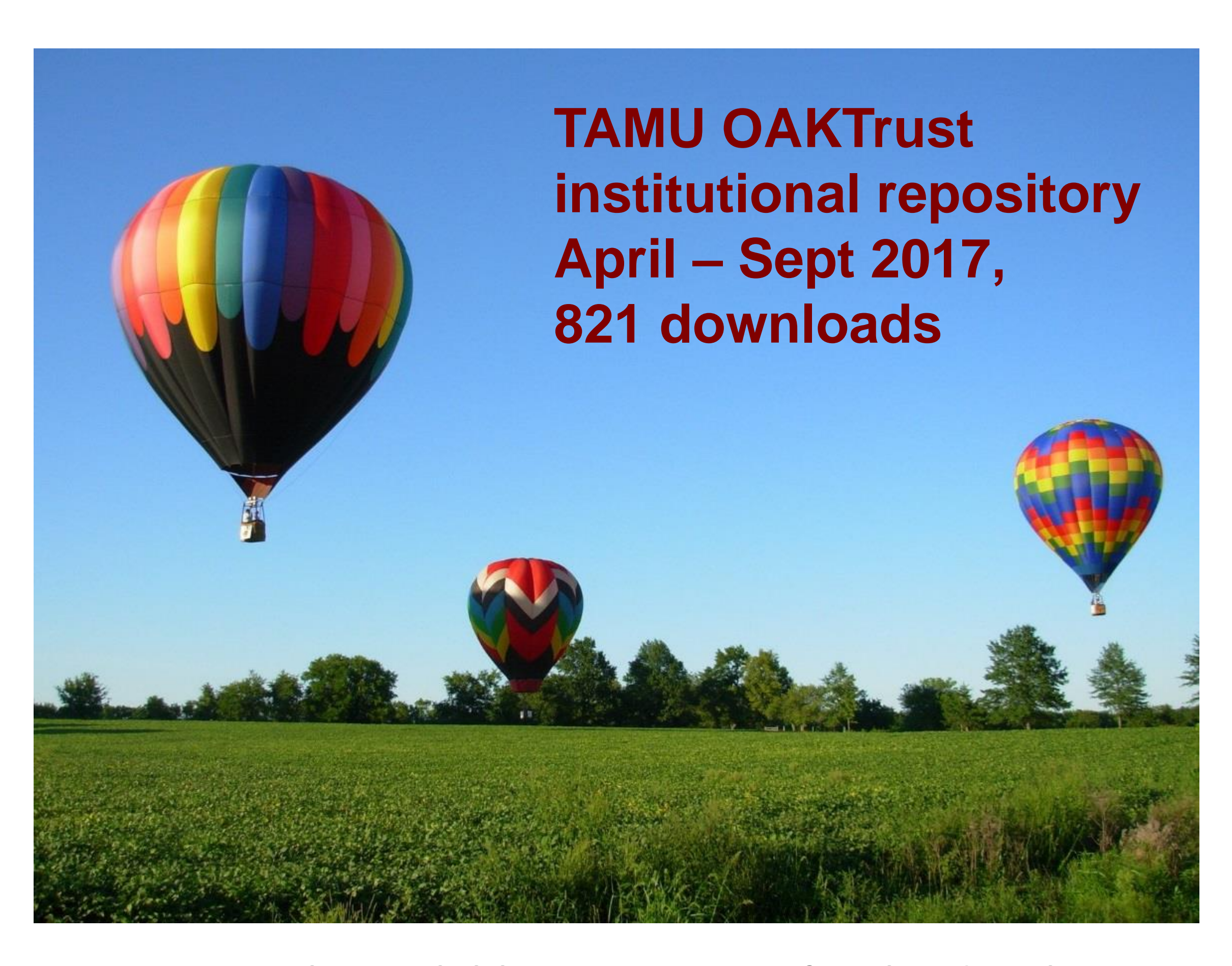
Figure 5. Freely available, promote to faculty development

The document is in the Texas A&M University institutional repository, OAKTrust, under a Creative Commons license allowing sharing with attribution. The original bibliography authors plan to add this information to the next edition in Summer 2018.