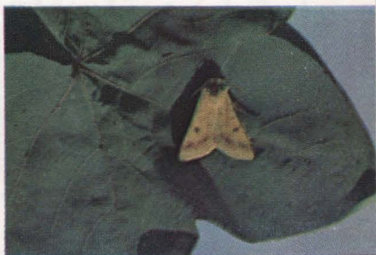
ADULT COTTON BOLLWORM MOTH