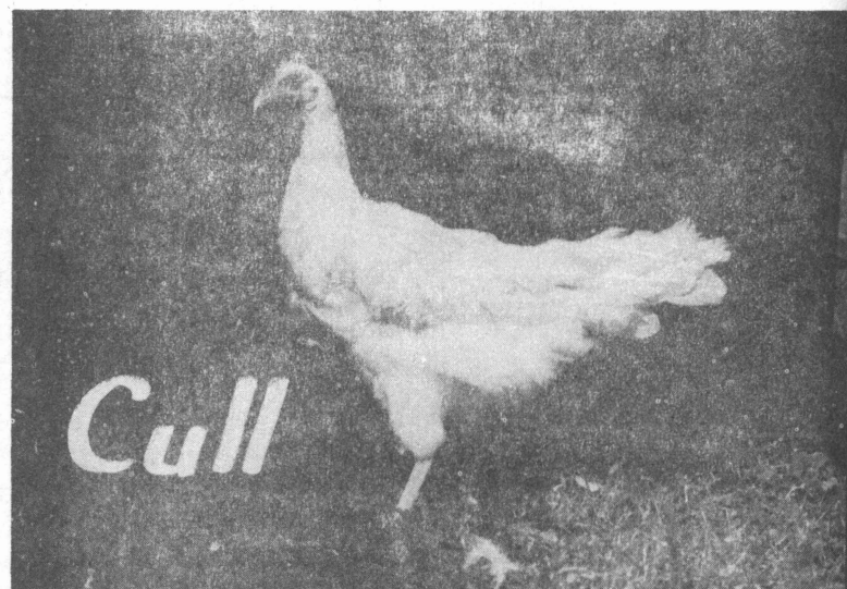
Body shallow in depth. Back narrow and short. Lazy—usually spends lots of time on the roost.