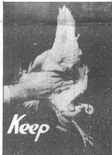
Full — Soft — Pliable Abdomen.