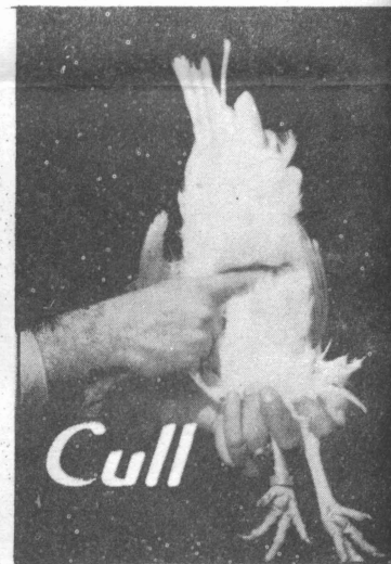
Very little body capacity. Shallow in depth. Narrow in back, occasionally hard and fat.