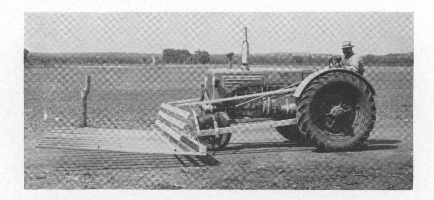
This buck rake is raised by means of the tractor power lift. It may also be used for moving bundle feed.