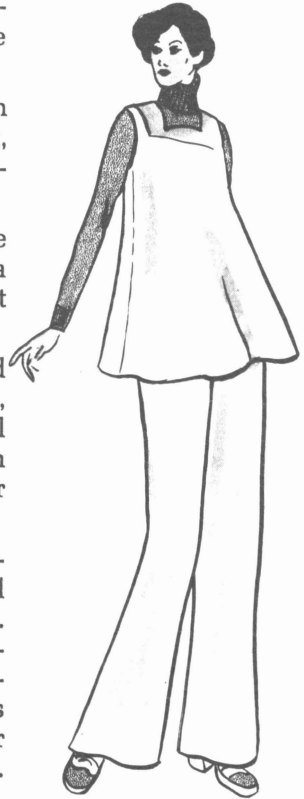
Fig. 3. Jumpers may be non-seasonal or transitional wardrobe items.

While one-piece dresses are attractive and generally flattering, separates are more versatile. If you choose separates, see that the bodices are long enough to cover the abdomen.