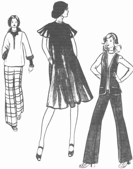
Fig. 1. Many items from the present wardrobe can be worn for several months.

skin clean. Since skin may feel uncomfortable because of stretching, wear soft, cool, absorbent fabrics.