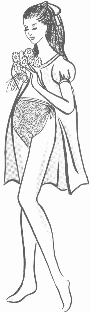
Fig. 8. Maternity pantyhose with stretch panel.

Selecting and wearing attractive maternity wear can help you feel better because you know you look your best. Today's maternity clothes and lingerie follow the same fashion trends as regular womenswear, but allow the necessary fullness for figure changes. Plan your wardrobe carefully and you will look lovely for any occasion.