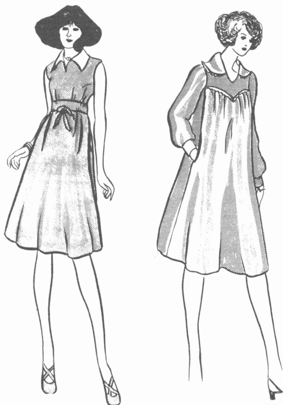
Fig. 4. Attractive styles fall loosely from the shoulders or may be semi-fitted.

To de-emphasize the middle contour, focus attention upward with attractive necklines and yokes, colorful scarfs and jewelry or decorative trim near the face.