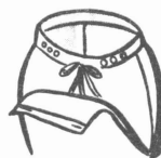
Fig. 5. Tie-front in non-stretch fabrics with panel covering.