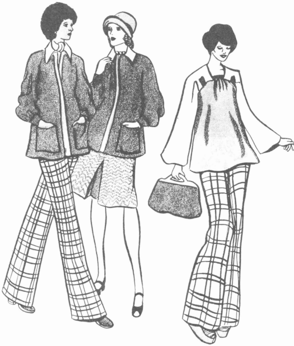
Fig. 2. Separates make versatile maternity wear.

1. Plan purchases to coordinate with items in your present wardrobe. Depending on current styles, you can also wear many garments after pregnancy with little or no alteration. Reduce fullness with a belt or a few seams if needed.