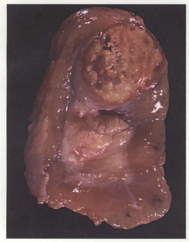
Tubercles destroy the tissue of internal organs.