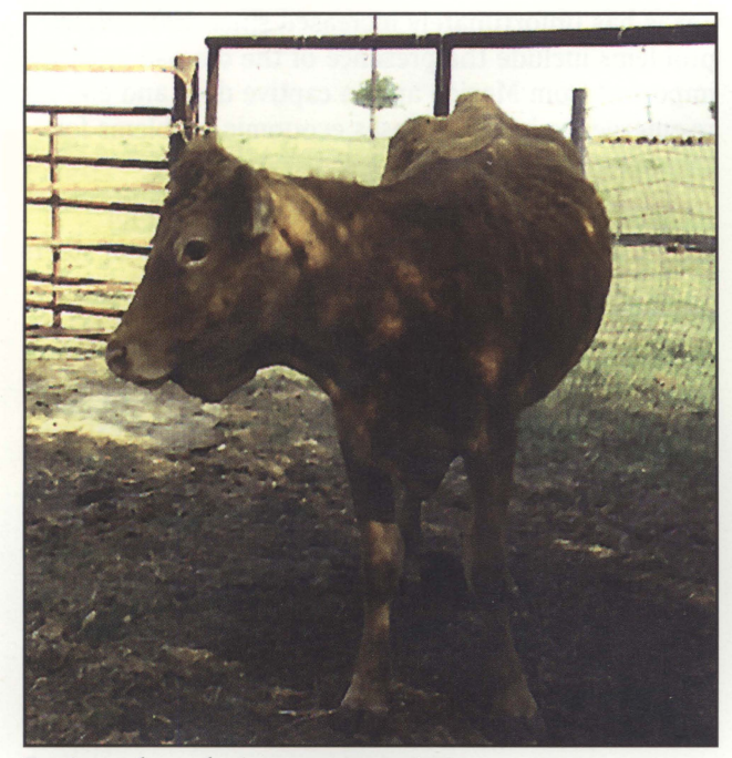
Bovine tuberculosis causes emaciation.

while biosecurity practices target the sources and transmission of diseases and the immunity of the cattle.