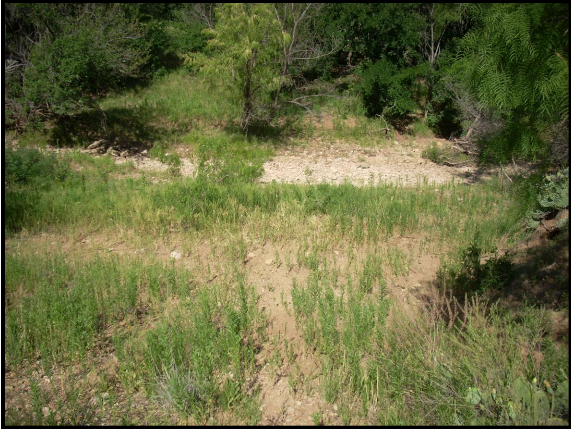
Figure 3. Battle Creek (facing West)