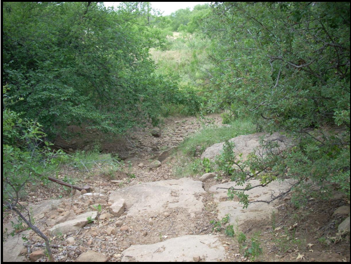
Figure 4. Eubanks Creek (facing West)