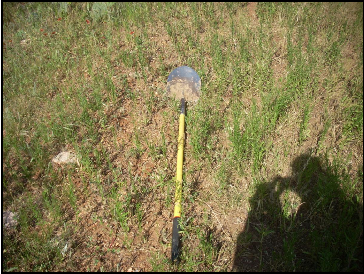
Figure 5. Ground Visibility East of Battle Creek (facing West)