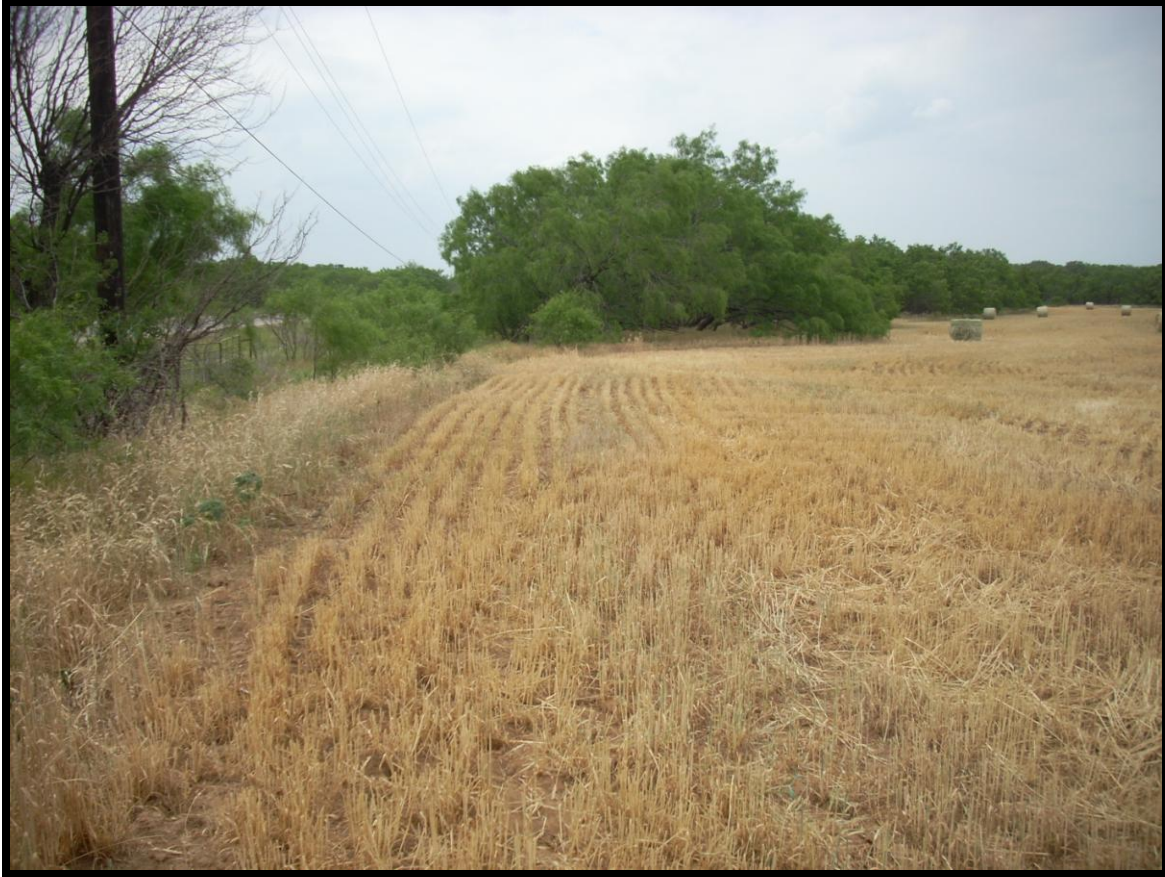
Figure 7. Improved Pasture

From the borehole exit point, the proposed pipeline route will follow a dirt, two-track road up the slope of a ridge in a westerly direction. Approximately 200 meters of this ridge was visually examined for cultural materials. Shovel tests were not excavated due to the excellent ground visibility and the fact that limestone bedrock was exposed on the ground surface. The field survey ended at a point about 200 meters west of Eubanks Creek, and the remainder of the proposed water line was examined using the “Windshield Survey” method with occasional stops to look at the surface on the ground.