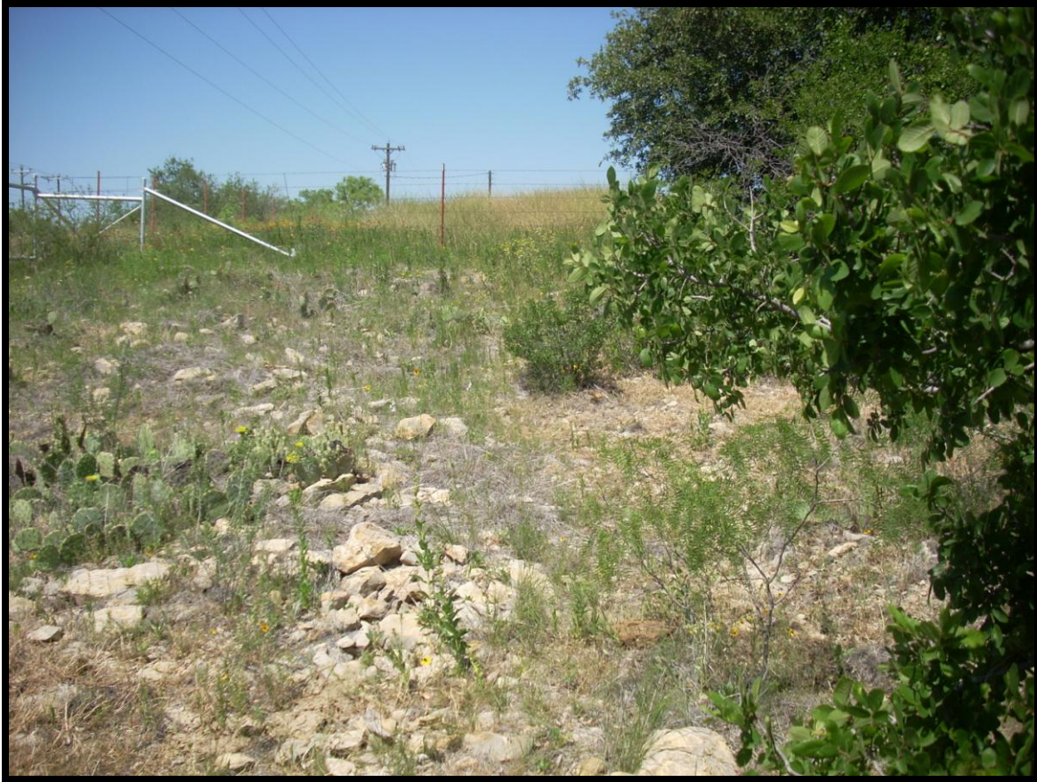
Figure 6. Exposed Limestone Bedrock on Ridge