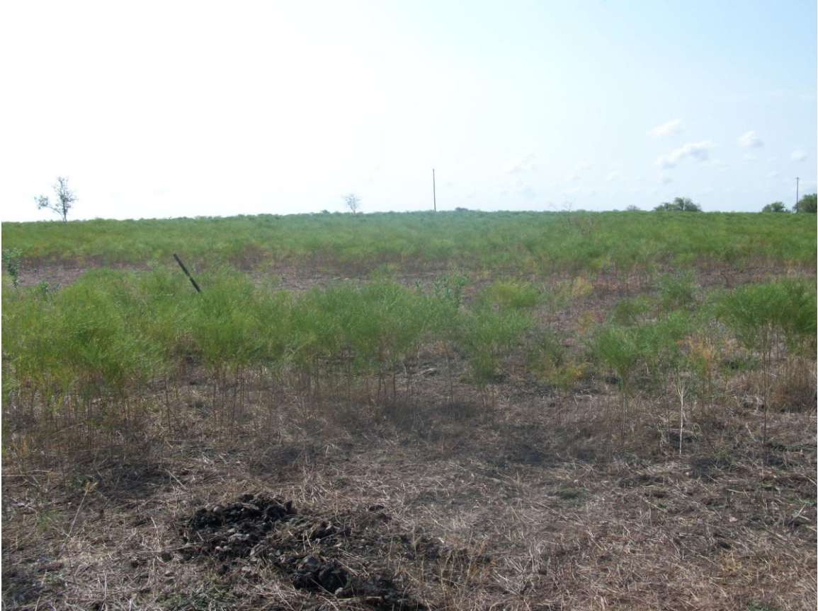
Upland Area (Shovel Test 3 in Foreground)