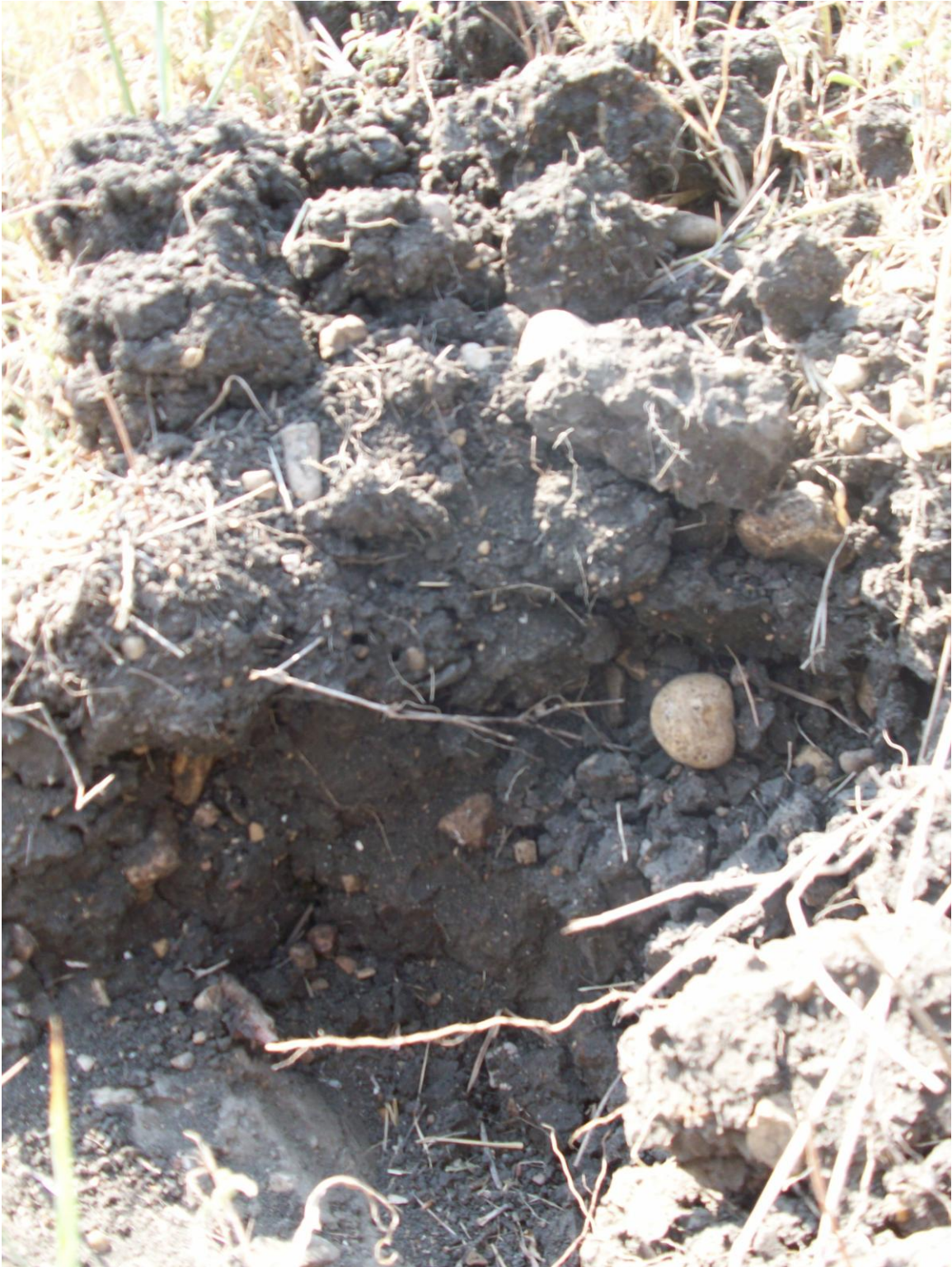
Shovel Test 4 (gravels throughout test)