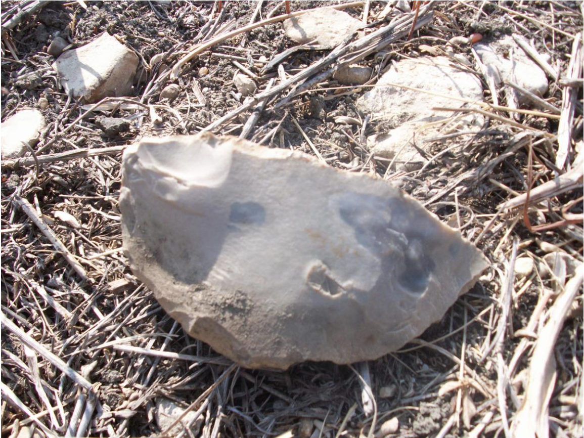
Typical Chert Cobble (observed near Shovel Test 2)