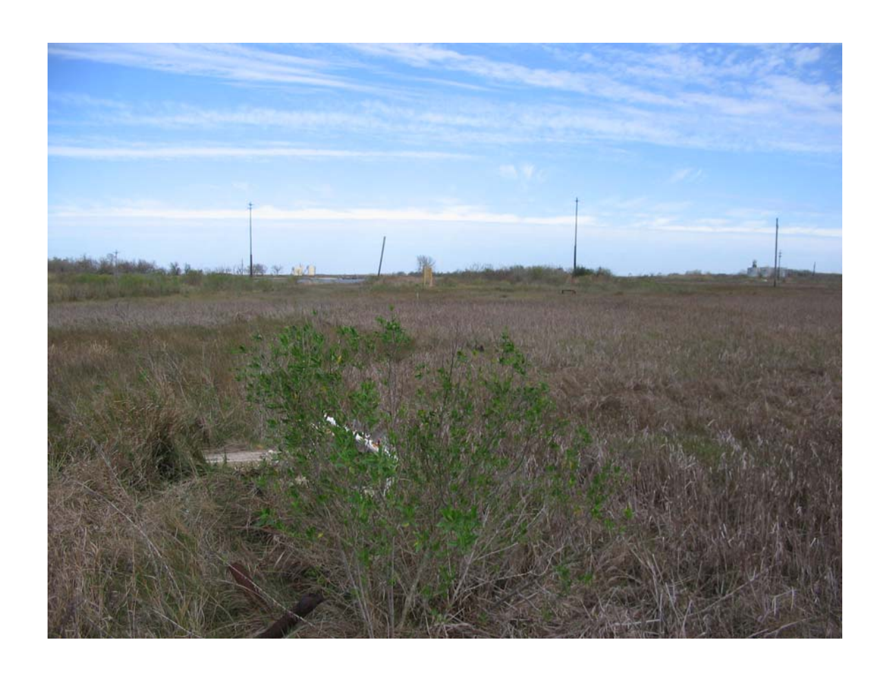
Figure 3. Central Gas Sales Facility Site (looking north)