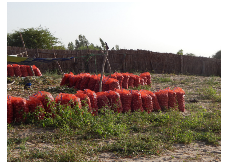
Above. A perspective of community members as they transition from their fisheries to the tending and harvesting of their market gardens.