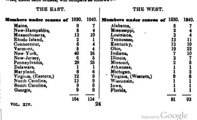
Figure 2. The Home Missionary

2. From 1830 to 1840 the ratio of representation in Congress was 1 member for every 47,700 p. reons, five slaves being computed equivalent to three free persons. Since the census of 1840, a select Committee of Congress on the apportionment of representation, has reported recommending 68,000 as the number to be entitled to send a member. Should this recommendation be adopted, as it probably will, the representation of the East and the West, under each census, will compare as follows:—