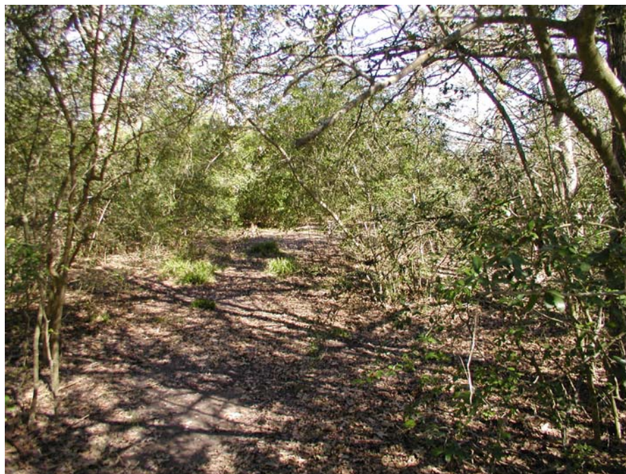
Fig. 3. Woodland habitat study site used for the nocturnal blow fly oviposition study conducted near Snook (Burlleson County), Texas, in 2003.