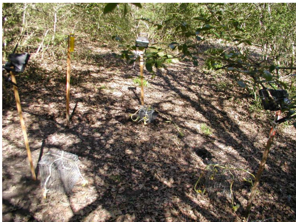
Fig. 5. Artificial lighting system at the 2003 woodland habitat experimental site near Snook (Burlson County), Texas.