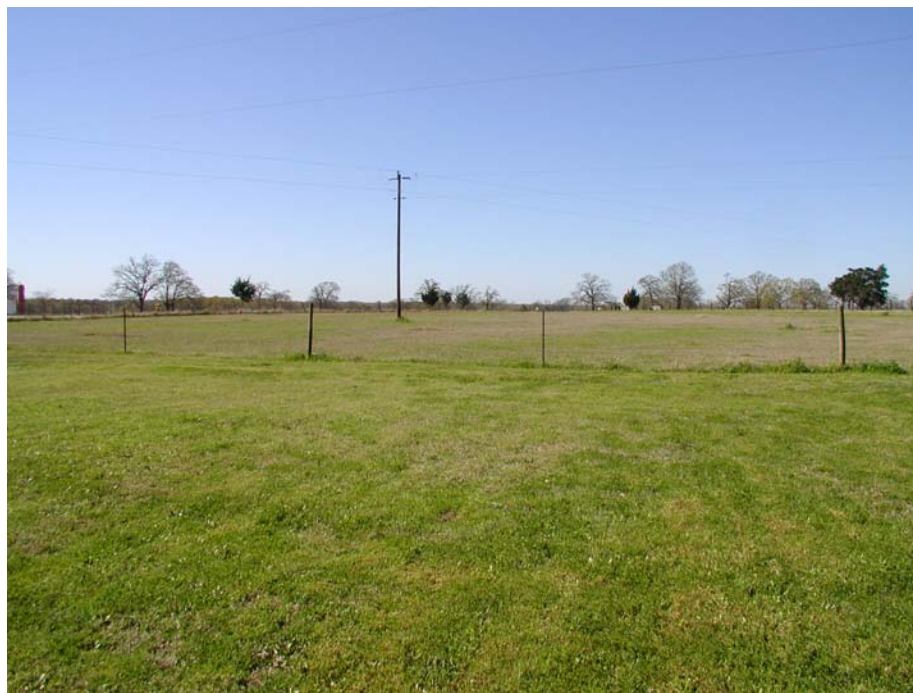
Fig. 2. Prairieland habitat study site used for the nocturnal blow fly oviposition study conducted near Snook (Burlleson County), Texas, in 2003.