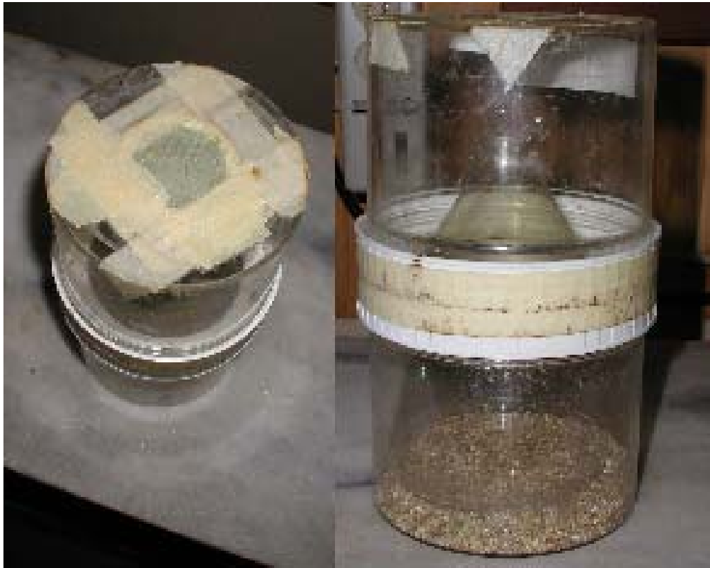
Fig. 7. An example of plastic, modified, Bioquip® rearing containers in which blow fly eggs and larva were reared for 2003 nocturnal oviposition experiments near Snook (Burlson County), Texas.

Once nocturnal monitoring ceased for the night (ca. 1.3 h before official sunrise), the baits were collected and placed in separate clean, dated, plastic, fly-rearing containers with vermiculite and 1 millimeter mesh over the openings of the containers sealed with masking tape. New ground beef bait allotments were placed at each site 0.5 h after official sunrise to be used as controls (daytime exposure). These daytime baits were then collected and placed in separate clean, dated, plastic fly-rearing 0.10 h before official sunset.