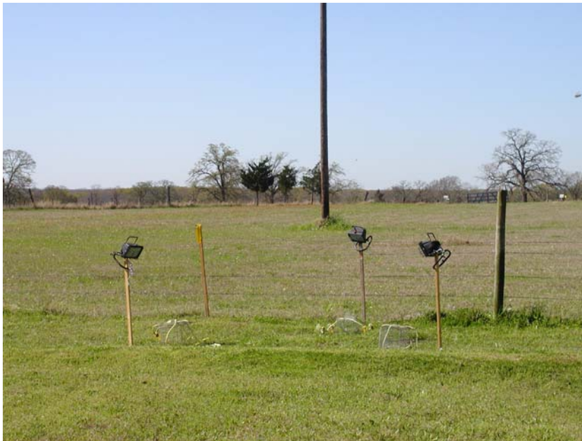
Fig. 6. Artificial lighting system at the 2003 prairieland habitat experimental site near Snook (Burleson County), Texas.

powered by 110 v extension cords leading from external outlets on Dr. Olson's house and created artificial lighting for the oviposition experiments when such was called for. When artificial lighting units were powered on in one experimental habitat, its counterpart experimental habitat had no artificial lighting exposure whatsoever, and was only lighted by natural conditions. Artificial lighting alternated from one given habitat (i.e. prairieland) to the other habitat (i.e. woodland) after a week in the spring trial (June 5–June 20) and summer trial (June 21–August 14) with only one habitat under artificial lighting and the other under natural conditions for seven consecutive days each; and 4 days for the fall trial (October 20–October 30) and winter trial (December 1–10) with