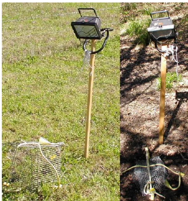
Fig. 4. Individual artificial lighting in prairie (A) and woodland (B) habitats for 2003 nocturnal oviposition experiments near Snook (Burlson County), Texas.